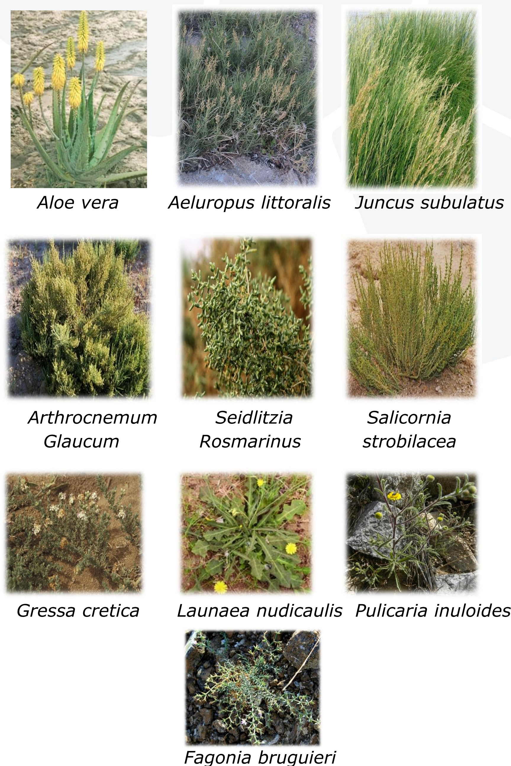
Fig 2. Natural Plants toletrent to severe salinity surveyed on the study area of the Sabkhat Al-Jabbul Lake banks.

The survey of the study area lead to find the following severe salinity tolerant plant species in the bank of Al-Jabbul Lake (Fig 2):