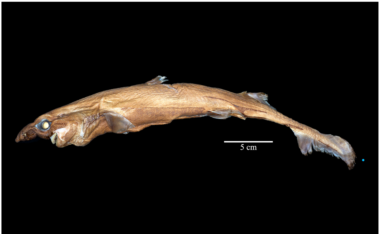
FIGURE 1. Etmopterus lailae new species, immature male holotype (BPBM 40183).