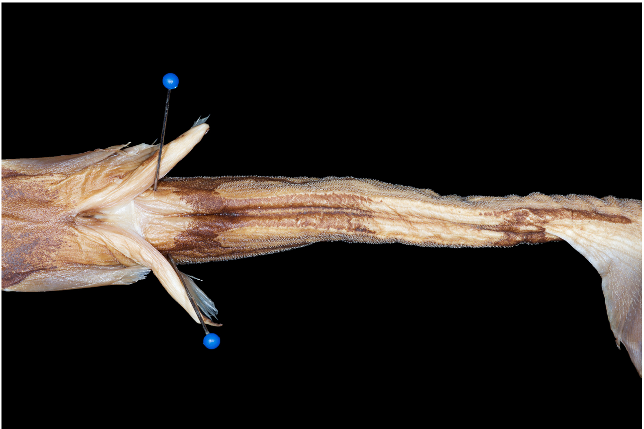
FIGURE 4. Ventral flank marking between pelvic fins and lower caudal origin of Etmopterus lailae new species (holotype BPBM 40183).

Vertebral counts: total vertebral counts 86 (79–82); monospondylous 40 (40); diplospondylous 17 (13–15); total precaudal 57 (53–55); caudal 29 (26–27). Spiral valve count is 16 (14–16).