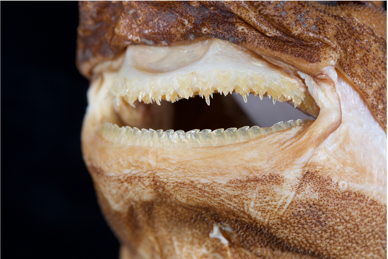
FIGURE 2. Tooth morphology of upper and lower teeth of immature male holotype (BPBM 40183).

Teeth dissimilar in upper and lower jaw (Fig. 2); upper jaw teeth with strong central cusp flanked on each side by two smaller lateral cusplets, less than one-half the height of median cusp, and decreasing in size distally; lower jaw teeth unicuspid, blade-like, oblique, fused into a single row. Tooth count in first row of upper jaw 24 (22–24) and in first row of lower jaw 28 (26–26).