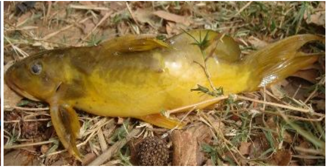
f) Synodontis violaceus (Pellegrin, 1919)