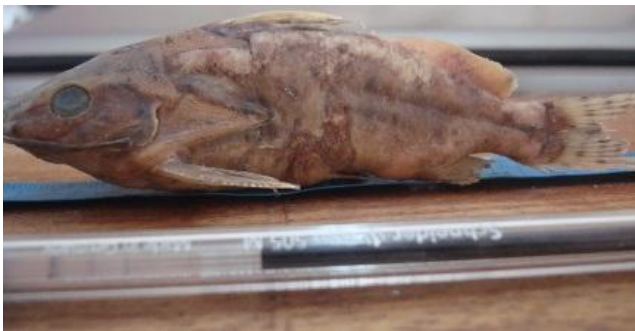
k) Synodontis nigrita b (Valenciennes, 1840)