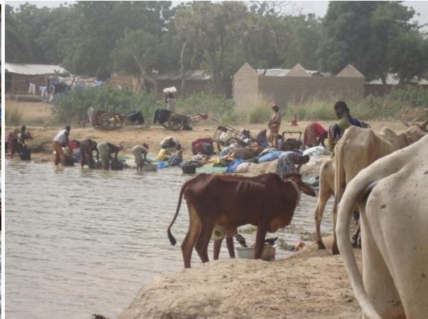
Fig 3: Multiple utilizations of the river, (1) men and women are washing their clothes and doing dishes and (2) animals (oxen) are drinking water. (Photo Arame).