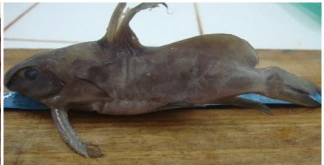
j) Synodontis melanopterus (Boulenger, 1903)