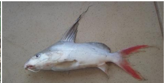
d) Synodontis clarias (Linnaeus, 1758)