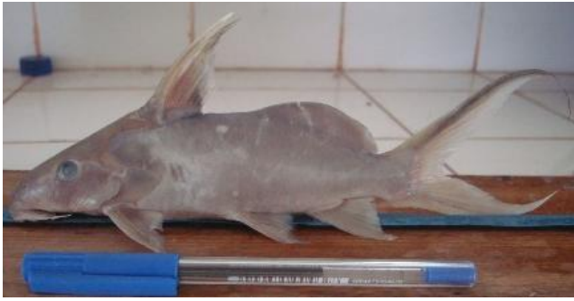
e) Synodontis sorex (Günther, 1864)