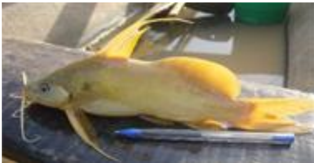
a) Synodontis schall (Bloch & Schneider, 1801)

Synodontis nigrita b: Synodontis nigrita with non-apparent spots.