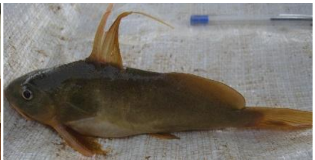
n) Synodontis frontosus (Vaillant, 1895)