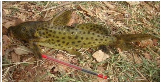
l) Synodontis courteti (Pellegrin, 1906)