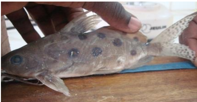
i) Synodontis ocellifer (Boulenger, 1900)