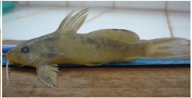
h) Synodontis macrophthalmus (Poll, 1971)