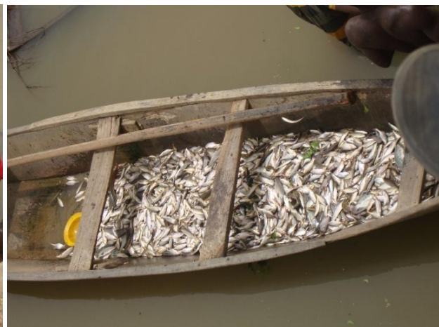
Fig 4: Fisherman catches comprising small fish individuals that indicate overfishing.