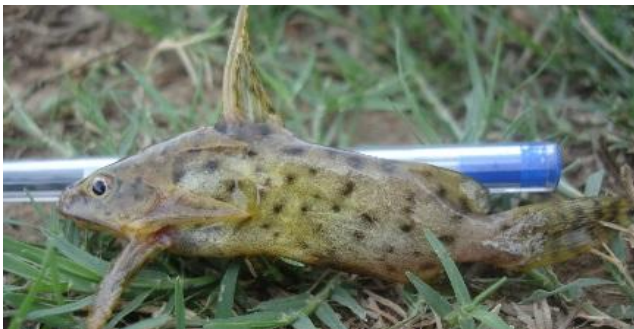
c) Synodontis nigrita a Valenciennes, 1840