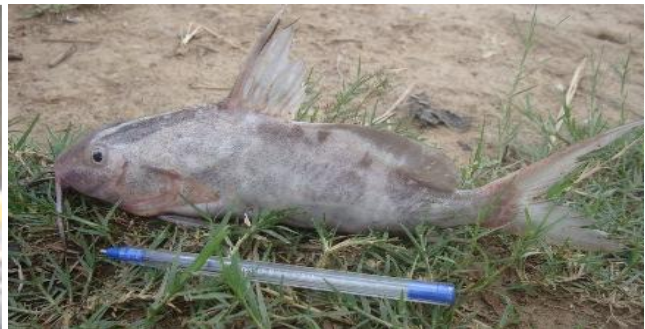
b) Synodontis membranaceus (Boulenger, 1907)