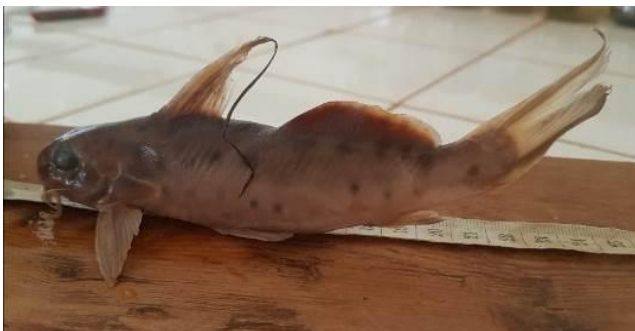
m) Synodontis filamentosus (Boulenger, 1901)