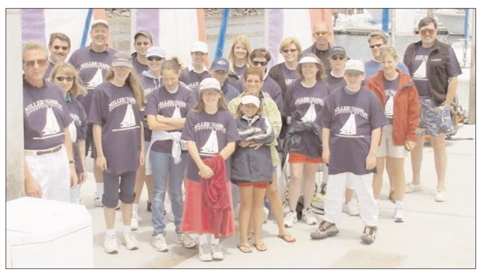
Seminar West Regatta Sailors