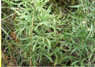
Larkspur Delphinium geyeri (Hellebore family) native

Beautiful plants that are a wonderful contrast to the otherwise mostly yellow blooms around them. These are toxic to most livestock except sheep, so the first cattlemen in this area did not graze their cattle up here.