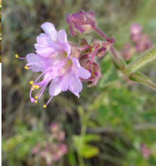
Hairy four o' clock Mirabilis hirsuta (Four p' clock family) native.

Easily overlooked inconspicuous flowers on small stems with few leaves. The small flowers delicate lavender with protruding stamens.