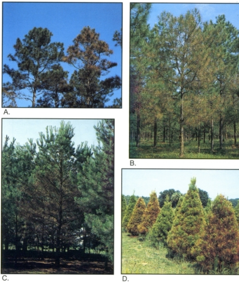
Fig. 1. Symptoms of needlecast on pines in Florida. A) Healthy (left) and diseased (right) slash pines. B) Severely infected slash pine. C) Severely infected loblolly pine. Note concentration of symptoms in lower portion of tree crown. D) Severely infected Christmas trees.

INTRODUCTION: Needlecasts (also written needle casts) are common, yet complex, and often poorly understood fungal diseases of conifers. Collectively, the term needlecast refers to distinct foliage infections which are considered different from needle blights on the basis of bases of symptoms produced, disease cycles and modes of resulting epidemics, and/or specific causal agents. Merrill (1990) discusses foliage blight (including conifer needle blight) as sudden and rapid foliage death resulting from direct foliage infection. He points out that blight infections have short incubation periods (time from infection to symptom expression) and repeating cycles (infectious spore to infectious spore); e.g., as little as a few days. The results are "compound interest diseases" and potentially explosive epidemics. Needle blights are caused by a variety of pathogenic fungi, the repeating infection cycles of which are often initiated by asexual spores (conidia). Conversely, Merrill (1990) urges that needlecast be applied more restrictively to "loss of leaves caused by spp. of Hypoderma, Lophodermium, Rhabdocline, or other Rhytismatales" ( sensu Hawksworth et al. 1995) "with few exceptions." According to Merrill, needlecasts are "simple interest diseases" with only one infection cycle