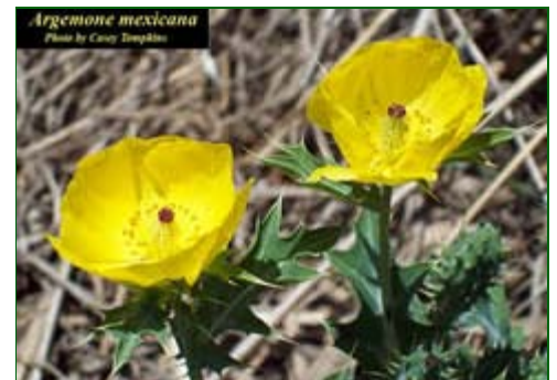
Argemone mexicana (Mexican prickly poppy)