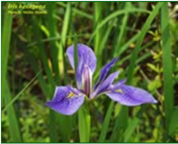
Iris hexagona (Dixie iris)

although it is apparently absent from the western Panhandle, the southern tip of the peninsula and the Keys. Its wider range encompasses the Southeast from South