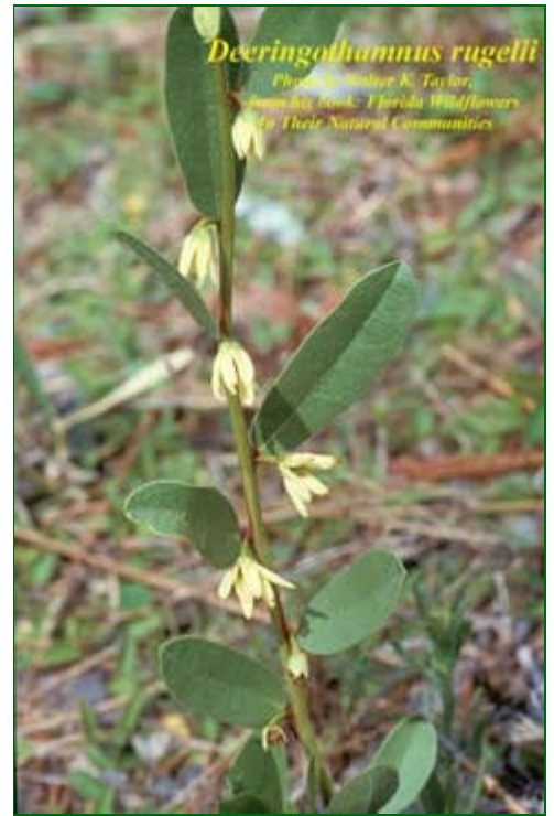
Deeringothamnus rugelii (Rugel's false pawpaw, yellow squirrel-banana)

Iris hexagona Walter (Dixie iris) , from a genus of approximately 210 species in temperate Eurasia, North Africa and North America. Iridaceae. This is the showiest Iris species native to Florida, and the most common as well. It grows in swamps, marshes and wet prairies throughout much of the state, although it is apparently absent from the western Panhandle, the southern tip of the peninsula and the Keys. Its wider range encompasses the Southeast from South Carolina to Texas. Several varieties have been recognized, and one, var. savannarum (Small) R.C. Foster, is often considered a separate species. The Dixie iris grows nearly a meter tall, from thick, branching rhizomes that can produce dense colonies in moist, mucky soil. As in all irises, the narrow, sword-shaped leaves are borne in a fan-like arrangement at the base of the plant; this species has an additional one or two leaves on the flowering stem. The leaves are often yellow-green, and they wither soon after the plants have bloomed. The beautiful, showy, blue or violet flowers are 10-15 cm across and appear in early to late spring, depending on the locality. They are borne in succession from a modified bract, termed a "spathe," at the tip of the flowering stem branches. The large, heavy capsules are hexagonal in cross-section and contain large seeds that are corky and buoyant when mature. The Dixie iris is one of a