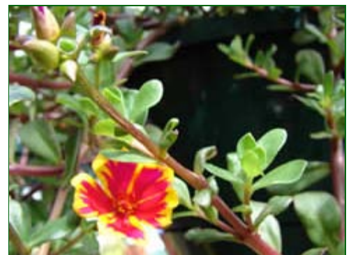
Portulaca umbraticola (wingpod purslane)