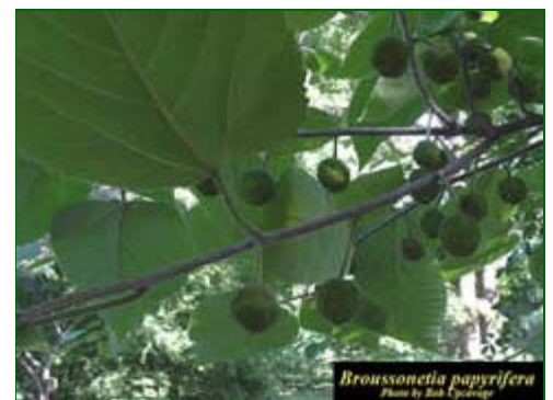
Broussonetia papyrifera (paper mulberry)