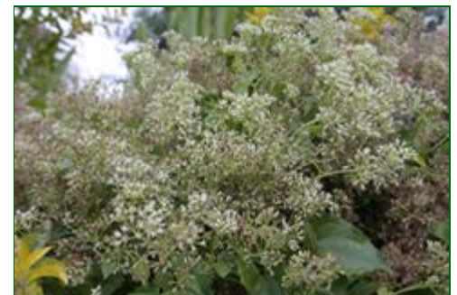
Mass of Mikania micrantha in full bloom at a nursery in Miami-Dade County.