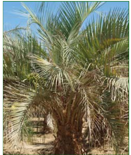
Butia capitata (pinto palm) in the landscape.