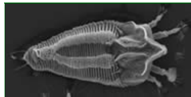
Mesalox pitangae (pitanga or Surinam cherry mite)