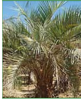
Butia capitata (pinto palm) in the landscape.

al., 2007 (a root-lesion nematode), a new Host record , was found infecting the roots of the ornamental palm Butia capitata (pinto palm).