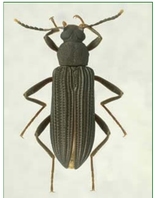
Strongylium cultellatum (a tenebrionid)