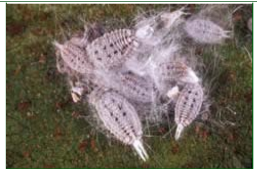
Ferrisia virgata (striped mealybug)