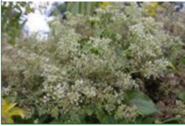
Mass of Mikania micrantha in full bloom at a nursery in Miami-Dade County.