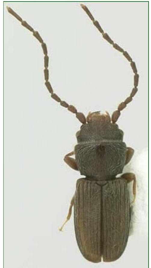
Cryptolestes atratulus (laemophloeid beetle)