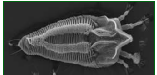
Mesalox pitangae (pitanga or Surinam cherry mite)