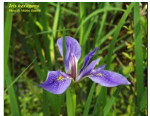
Iris hexagona (Dixie iris)