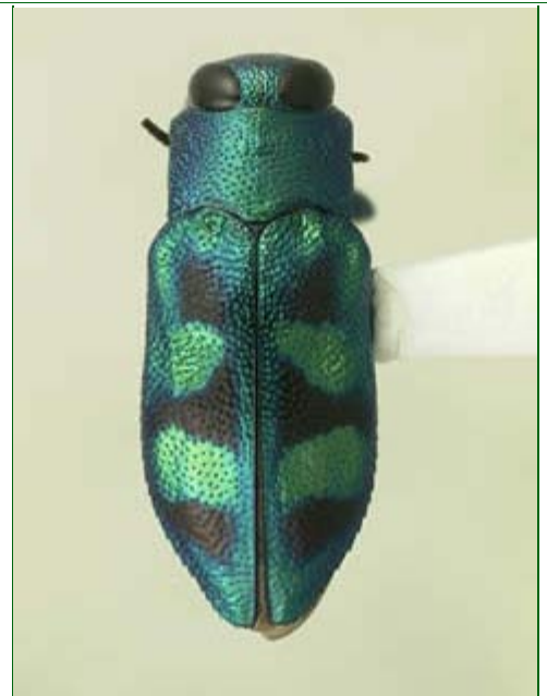
Chrysobothris scitula (buprestid beetle)

Paracoccus herreni (mealybug), a new USA country record , was found on hibiscus at a discount garden center in Bradenton. This species has been intercepted at ports (three records of interceptions), but it has not been recorded in the United States from plant material for distribution. There is little published information about this species. It is a pest of plants in the genera Manihot , Lantana and Acalypha . No additional specimens of