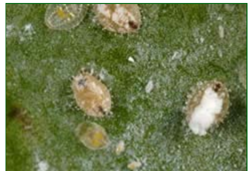
Siphoninus phillyreae (ash whitefly)