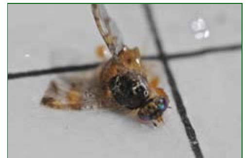
One of several trapped Ceratitis capitata (Mediterranean fruit fly)