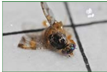
One of several trapped Ceratitis capitata (Mediterranean fruit fly) shown on a sticky board