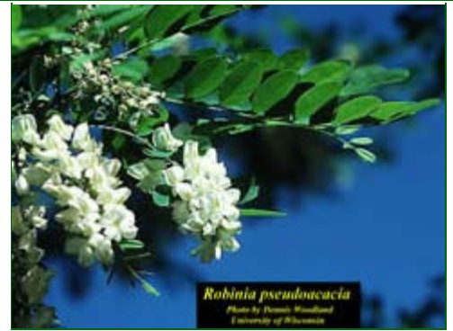
Robinia pseudoacacia (black locust)

Portulaca umbraticola is a widespread, usually weedy species, with broad, flat, fleshy leaves, that is native throughout much of South America into the West Indies and the southeastern and southwestern United States. In the Southeast, it is not weedy and occurs only on granitic and sandstone outcrops in Georgia and South Carolina. These plants have been treated in the past as a separate species, P. coronata Small, or more recently as a variety of P. umbraticola . In various areas of its range in the wild, the color of the flowers varies from purple to yellow or is bicolored red and yellow, and the size varies from 0.6 to 2.5 cm across. In 1982, the Pan American Seed Company of Chicago, Illinois, introduced a cultivar of this species,