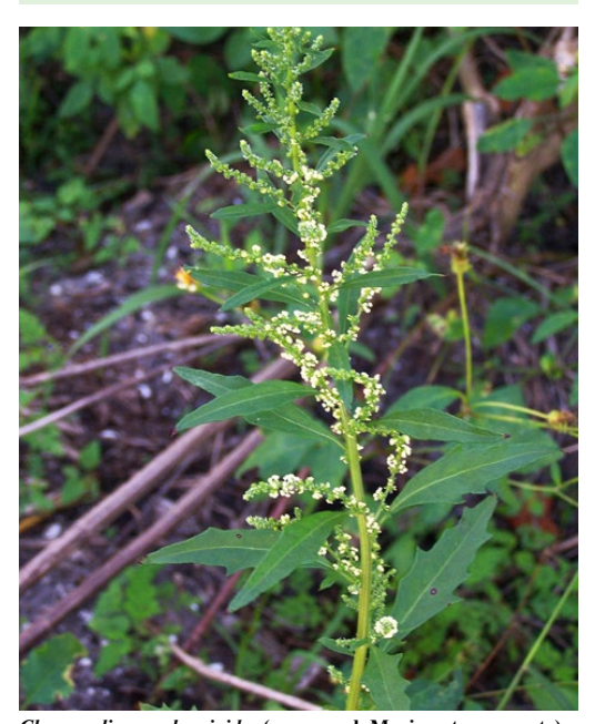
Chenopodium ambrosioides (wormseed, Mexican tea, epazote) Photograph courtesy of Dennis Girard, Atlas of Florida Vascular Plants <a href="https://florida.plantatlas.usf.edu/Photo.aspx?id=14254">https://florida.plantatlas.usf.edu/Photo.aspx?id=14254</a>