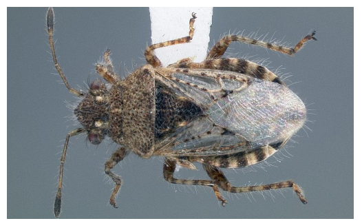
Arhyssus parvicornis, a scentless plant bug