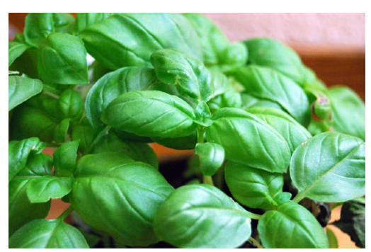
Ocimum basilicum (edible basil)