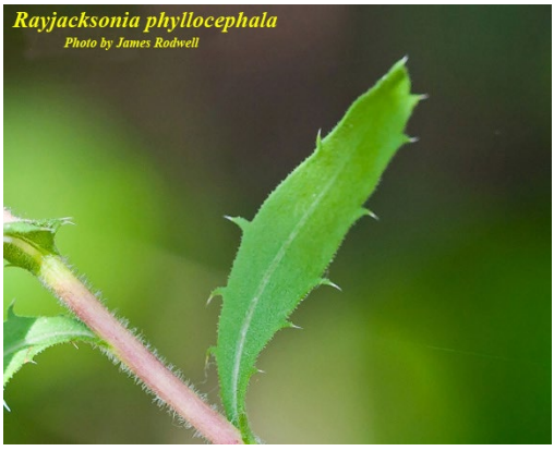
Rayjacksonia phyllocephala (camphor daisy, Gulf Coast camphor-daisy), leaf