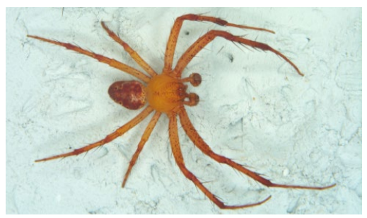
Araneus gadus, an orbweaver