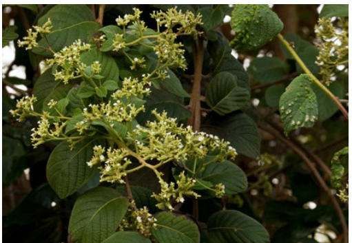
Tournefortia hirsutissima (chiggery grapes)