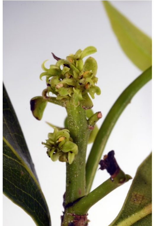
Limataphalara brevicephala , a psyllid (colony)

The tables are organized alphabetically by plant host if the specimen has a plant host. Some arthropod specimens are not collected on plants and are not necessarily plant pests. In the table below, those entries that have no plant information included are organized by arthropod name.