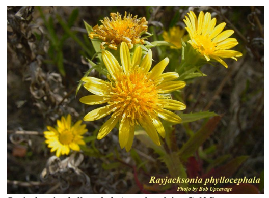
Rayjacksonia phyllocephala (camphor daisy, Gulf Coast camphor-daisy), flower