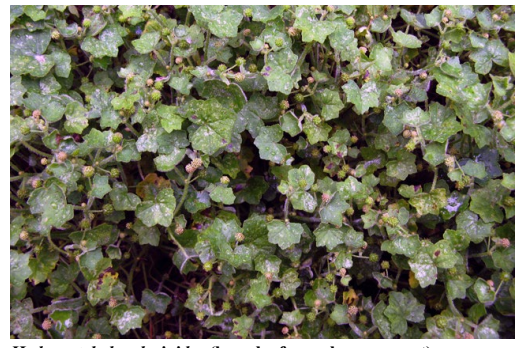
Hydrocotyle bowlesioides (largeleaf marshpennywort)