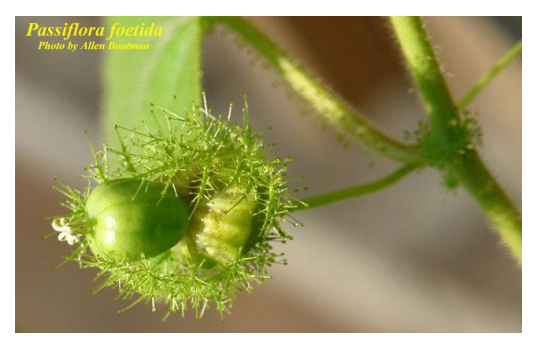
{\it Passiflora\ foetida\ } (fetid\ passion flower,\ running\ pop,\ love-in-amist),\ bracts