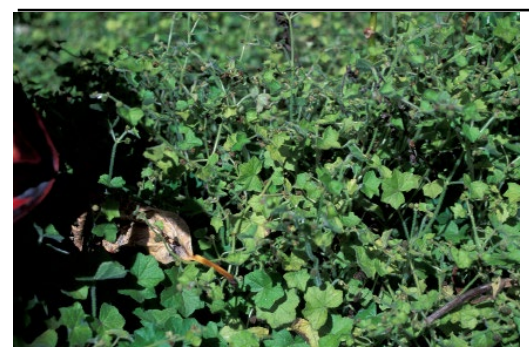
Hydrocotyle bowlesioides (largeleaf marshpennywort)