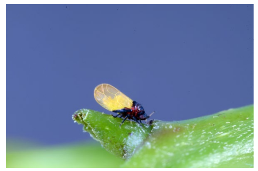
Limataphalara brevicephala, a psyllid (adult)