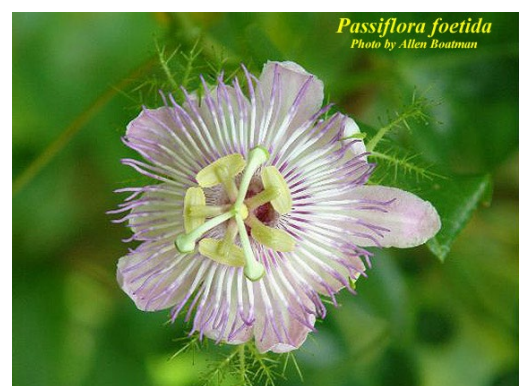
Passiflora foetida (fetid passionflower, running pop, love-in-a mist), flower

Photograph courtesy of Allen Boatman, Atlas of Florida Vascular Plants <a href="http://florida.plantatlas.usf.edu/Photo.aspx?id=15792">http://florida.plantatlas.usf.edu/Photo.aspx?id=15792</a>