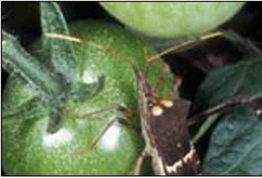
Fig. 3. Leptoglossus zonatus feeding on tomato fruit.