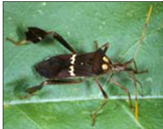
Fig. 1. Leptoglossus zonatus (the new state record specimen).