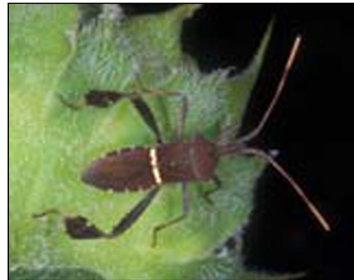
Fig. 6. Leptoglossus phyllopus , a common species in Florida.