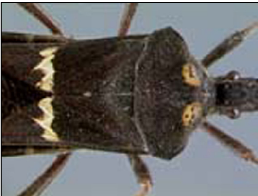
Fig. 5. Leptoglossus zonatus : close-up showing white transverse band and yellow pronotal spots.