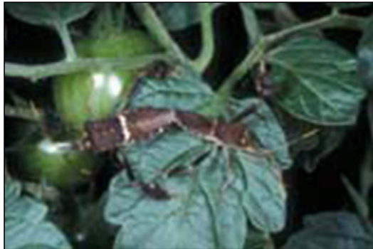
Fig. 2. Leptoglossus zonatus mating on tomato plant.