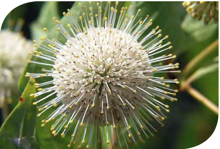
1b - Cephalanthus occidentalis (common buttonbush) close view of flower.