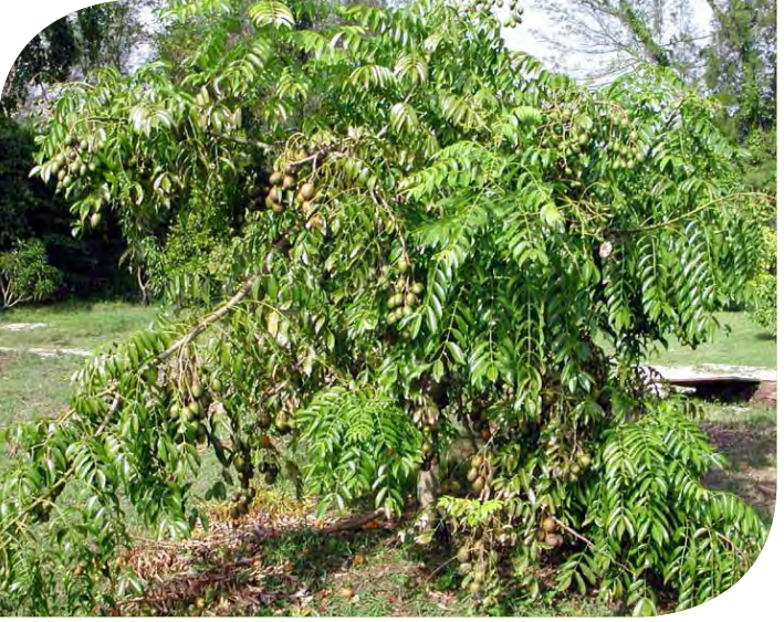
2a - Spondias dulcis (ambarella, June plum, golden apple) small tree.