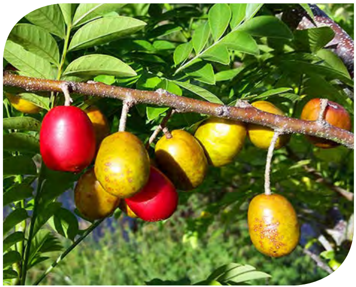
2c - Spondias purpurea (purple mombin, jocote), leaves and branch with ripening fruit.

2b - Spondias dulcis (ambarella, June plum, golden apple) ripe fruit.