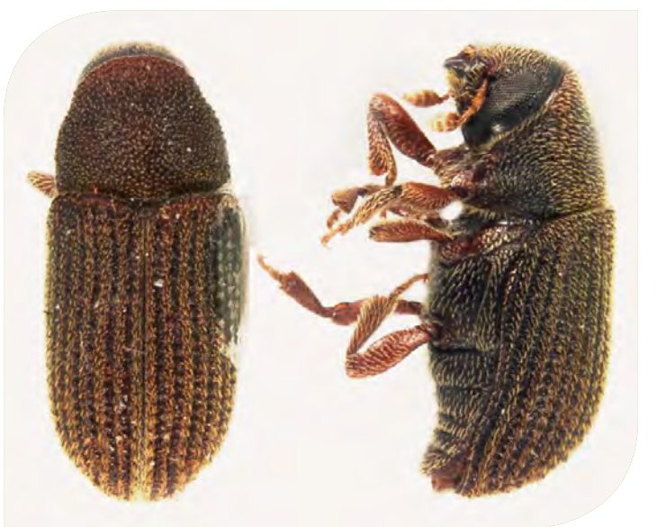
3 - Hylurgopinus rufipes (elm bark beetle).