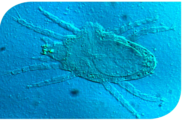
1a - Neopronematus neglectus, whole body of mite.

2 Crocidosema sp., a tortricid moth, new Continental USA record. This seems to be an undescribed species. It was reared on gray nickerbean plants ( Caesalpinia bonduc ) gathered to feed endangered Miami Blue butterfly caterpillars. The moth eclosed in March 2017. Older specimens cannot be found in the FSCA. Some congeners are pests, such as C. plebejana (Zeller) on cotton and okra, and C. longipalpana (Möschler) on litchi. Other relatives feed on legumes, so the host fits a pattern. In addition to unique genitalia, the specimen has a distinctive combination of male characters, including androconia on the wings and abdomen, that are intermediate between the C. plebejana and C. lantana groups. (Monroe County; E2017-1519; Sarah R. Steele Cabrera and Matthew J. Standridge, Florida Museum of Natural History, University of Florida; 22 February 2017.) (Dr. James E. Hayden.)