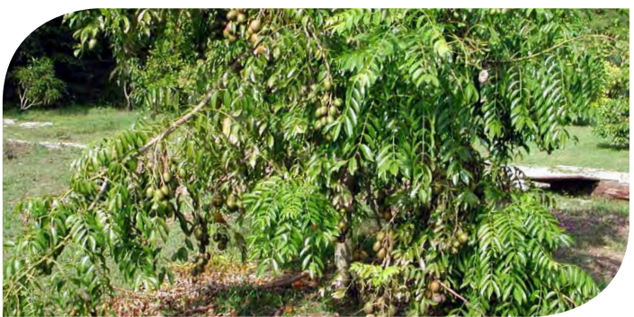
1 - Spondias dulcis (June plum, ambarella, golden apple) small tree.

4 Neopronematus neglectus (Kuznetzov), a mite, new Western Hemisphere record, was originally described from the Black Sea region in the Old World. It is not a plant feeder and is likely to be a fungivore and/or predator.