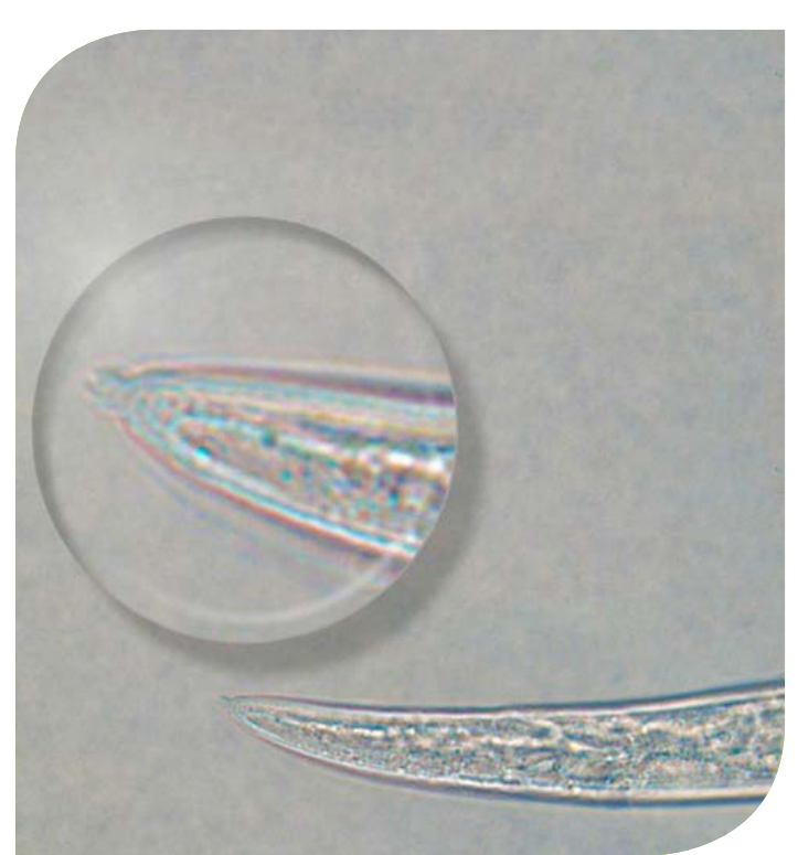
1a - Aphelenchoides besseyi female. Note tail mucro with small spikes in magnifying glass.

The use of fumigant nematicides during the past 50 years effectively controlled the nematode and allowed the nurseries to provide propagative strawberry runners free of foliar nematodes with consequent disappearance of A. besseyi from strawberry producing areas in Florida. The recent ban from the market of many chemical nematicides, including fumigants such as methyl bromide, has favored the re-emergence of plant-damaging nematodes in nurseries producing propagative strawberry runners. During the last two years, nematode infested runners have been supplied to Florida growers with consequent foliar nematode infestations in some strawberry operations near Plant City, Florida. Studies to characterize these emergent, foliar nematode populations using morphological and molecular analyses are in progress.