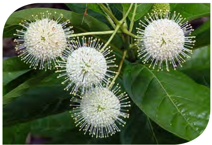
1a - Cephalanthus occidentalis (common buttonbush).

Cephalanthus occidentalis L. (common buttonbush), from a genus of six species native to tropical and warm regions. Rubiaceae. This widespread species is found in most counties of Florida and from Canada through the eastern half of the United States, as well as Mexico, California and the West Indies. This shrub or small tree grows to 4 m tall, along or in swamps, ponds, lakes and rivers and can be used as an ornamental plant in wet soils. The glossy, green leaves with entire margins are opposite or whorled in groups of three to four at a node. The veins and midrib are prominent as is the interpetiolar stipule. Flowers are clustered in a spherical 2-3 cm head of individual, tubular, four-lobed, white flowers. The pistil is exerted from each tube in an arrangement that reminds some people of a pin cushion pierced by straight pins. All parts of the plant contain phytochemicals that have proved toxic to horses, but other animals reportedly consume the plant without injury. (Palm Beach County; B2017-244; Matthew M. Miller; 2 June 2017 and Hendry County; B2017-272; Olga Garcia, USDA; 27 June 2017.) (Hall et al. 2011; Hammer 2002; Mabberley 2008; Perkins and Payne 1978; Wunderlin and Hansen 2011; http://www. wildflower.org/plants/result.php?id_plant=CEOC2 [accessed 7 July 2017]; https://plants.ifas.ufl.edu/plant-directory/cephalanthusoccidentalis/ [accessed 5 July 2017].)