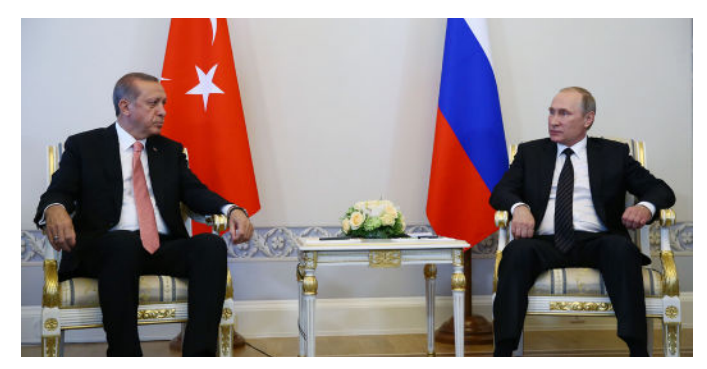
Erdogan and Putin meet in St. Petersburg, Russia, on August 9, 2016.

foreign visit, during which he and Putin agreed to normalize relations. Erdogan expressed gratitude for Putin's "psychological support."<sup>83</sup>