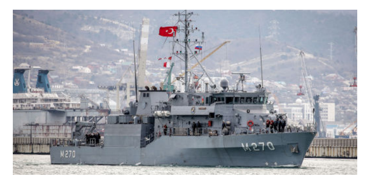
The Turkish minesweeper Akcay enters the harbor of the Russian port of Novorossiysk on March 6, 2019, for combined naval exercises in the Black Sea.

of Crimea and military build-up in the Black Sea,<sup>200</sup> which shifted the balance of power in Russia's favor.<sup>201</sup> Warning that the Black Sea had "nearly become a Russian lake," Erdogan sought a greater NATO presence.<sup>202</sup> That push softened following the Russian-Turkish reconciliation in 2016 but did not disappear.<sup>203</sup> In 2016, Turkey agreed to establish a NATO "tailored Forward Presence" in the Black Sea despite vocal Russian opposition.<sup>204</sup>