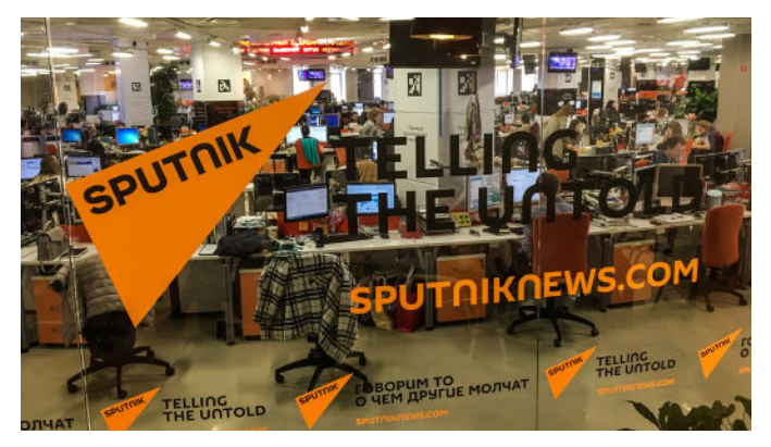
The main newsroom of Russia's state-owned Sputnik media outlet in Moscow on April 27, 2018.

Russia also maximizes its propaganda's reach by playing both sides of the Turkish information space. Russia influences mainstream pro-government networks through its ties to the Turkish government, including cooperation between Russian and Turkish state media, while Sputnik Turkiye and RSFM Radio often support pro-opposition narratives. This strategy allows Russia to pivot quickly to whatever narrative is most useful, especially during crises.<sup>380</sup> State-directed social media accounts and bots amplify this content among the Turkish public.<sup>381</sup> Pro-Russia Turkish outlets, such as the Patriotic Party's Aydinlik and Ulusal Kanal, further add to this mix.<sup>382</sup>