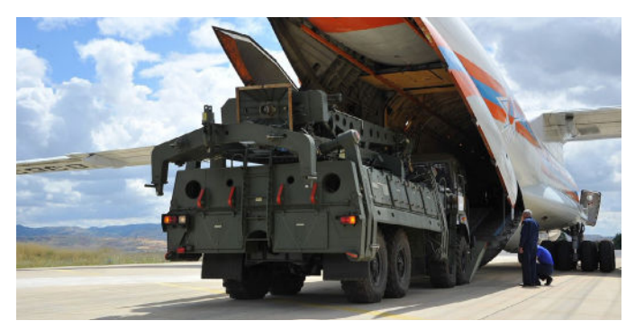
A Russian Ilyushin Il-76, carrying the first batch of equipment of the S-400 missile defense system, arrives at Murted Air Base in Ankara, Turkey, on July 12, 2019.

"either declaring its intention or trying to" undermine Ankara's outreach to the Biden administration.<sup>252</sup>