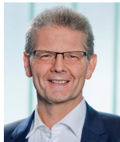
Franz Schulte Kone Cranes Cranes & Lifting Equipment