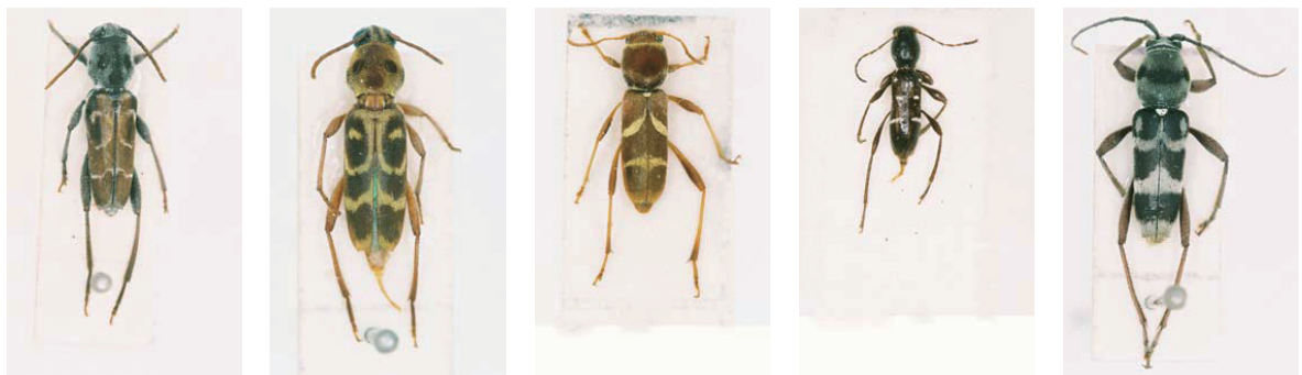
18. Xylotrechus carenifrons (Castelnau et Gory) ♂ 9.4mm