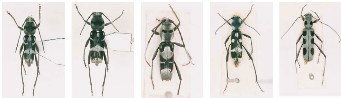
23. Chlorophorus moestus (Chevrolat) ♂ 7.5mm ♀ 11.4mm