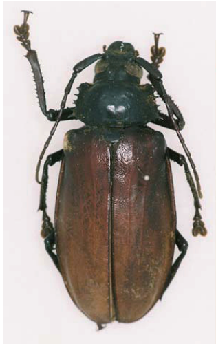
1. Rhapsipodus taprobanicus Gahan ♀ 61mm