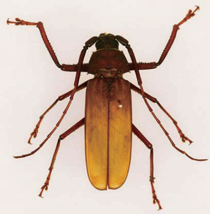
2. Anomophysis spinosa (Fabricius) ♂ 51mm