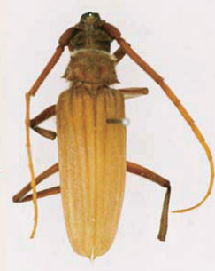
3. Megopsis (Megopsis) terminalis (Gahan) ♂ 26mm