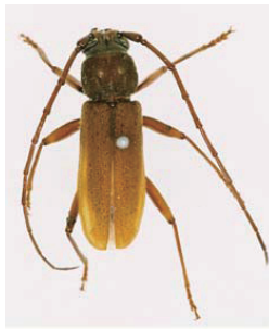
7. Gnatholea simplex Gahan ♂ 18.5mm ♀ 23.2mm