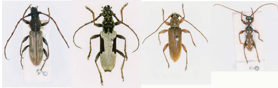
10. Dymasium minor Gahan ♀ 14mm