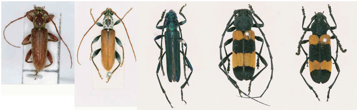
14. Ceresium nilgriense Gahan ♂ 12mm