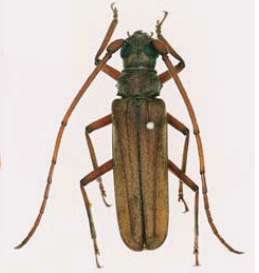
4. Spinimegopsis cingalensis (White) ♂ 27mm