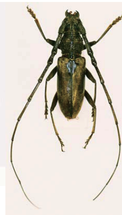
8. Diorthus cinereus (Fabricius) ♂ 28mm