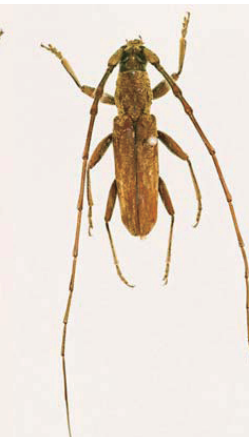
9. Dymasius machilentus (Pascoe) ♂ 21mm