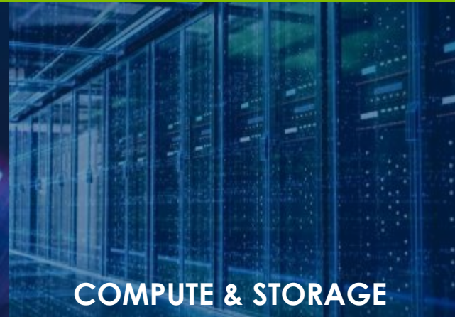
COMPUTE & STORAGE