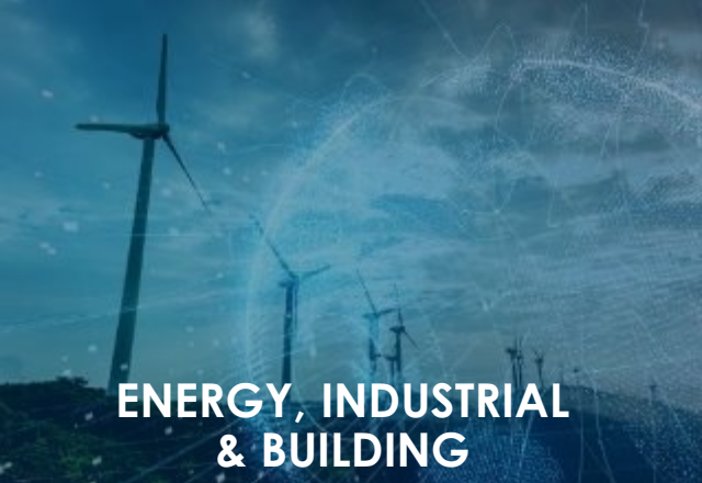
ENERGY, INDUSTRIAL & BUILDING