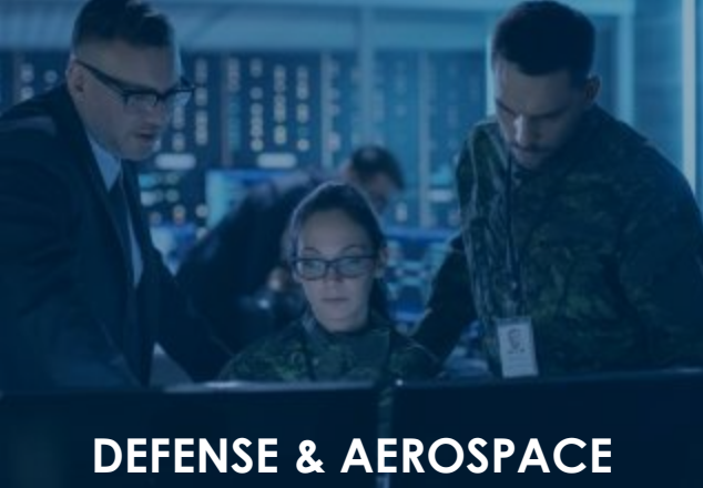
DEFENSE & AEROSPACE