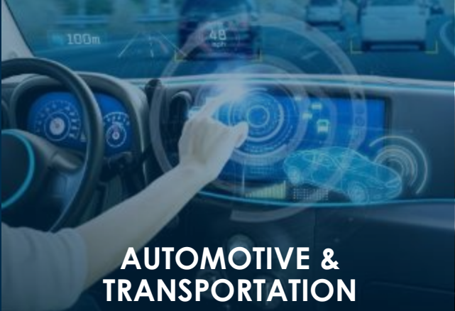
AUTOMOTIVE & TRANSPORTATION