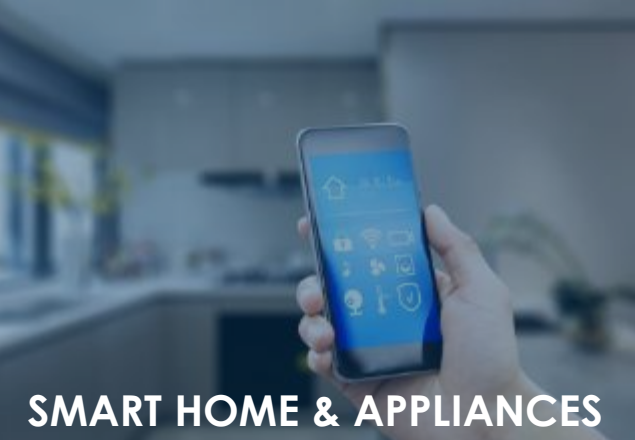
SMART HOME & APPLIANCES