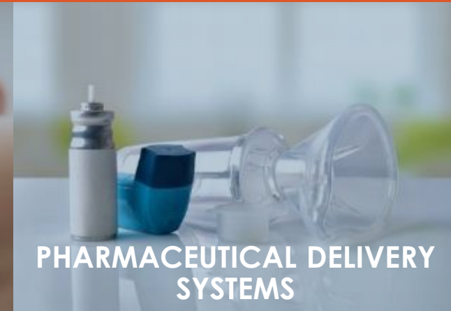
PHARMACEUTICAL DELIVERY SYSTEMS