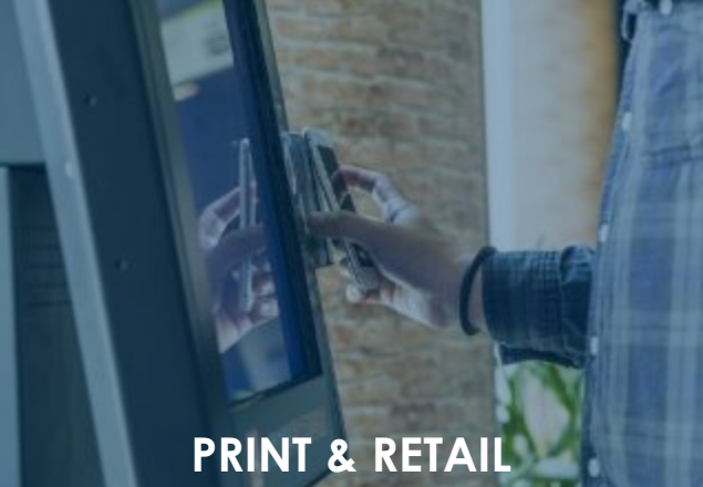
PRINT & RETAIL