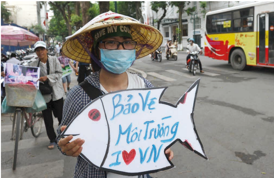
Protesters demonstrate against Taiwanese conglomerate FHS during a rally in Hanoi on 1 May 2016.

According to information received by VCHR, on 8 May, in the protests in Hanoi and Ho Chi Minh City, police looked on passively as government-hired thugs brutally beat peaceful demonstrators. Dozens were arrested and held in “social protection centers” for several days before being released.