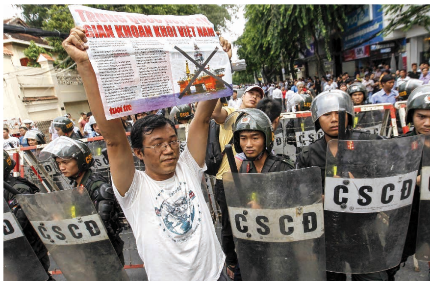
An anti-China protester stands in front of policemen blocking a street leading to the Chinese consulate during a rally in downtown Ho Chi Minh City on 11 May 2014.

The signing of two controversial border treaties between Vietnam and China in 1999 and 2000 without any public consultation triggered deep public outrage among Vietnamese from all walks of life, both inside and outside the country, and was followed by a torrent of spoken and written protests. 109 To the Vietnamese government's surprise, the signing of these agreements also ignited a flame of passionate patriotism within the population that continues to burn bright today. 110