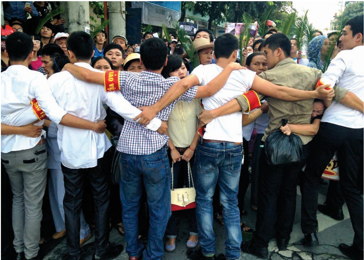
Plainclothes policemen form a human chain to prevent hundreds of protesters from approaching the court where lawyer Lê Quốc Quân faced charges of tax evasion at his trial held amid heavy security in Hanoi on 2 October 2013.