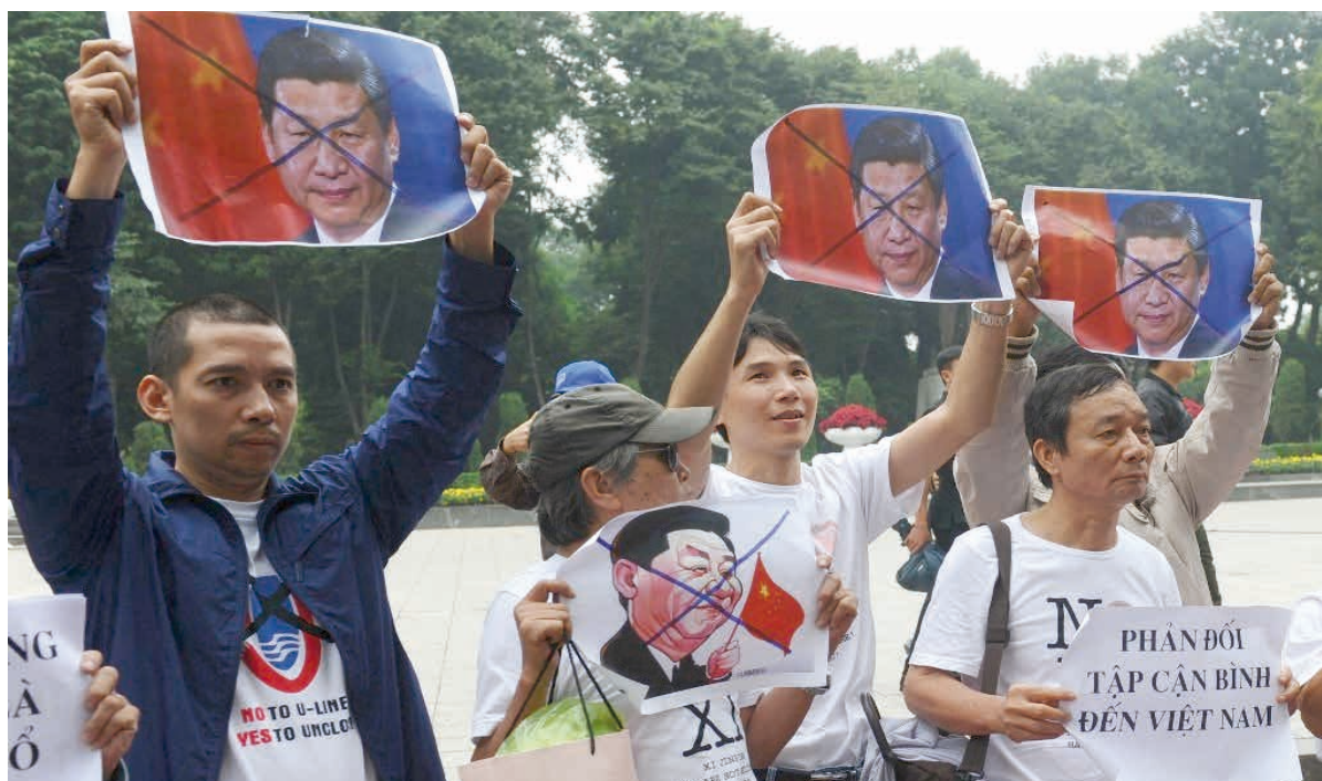
Protesters shout anti-China slogans as they hold up marked depictions of China's President Xi Jinping in front of the Chinese embassy in Hanoi on 5 November 2015, a few hours prior to the arrival of the Chinese leader for a two-day state visit.

Xi Jinping's visit to Vietnam in 2015. He was finally arrested on 1 March 2022, and sentenced to eight years in prison on 12 May 2023 under Article 117 of the Criminal Code. 177