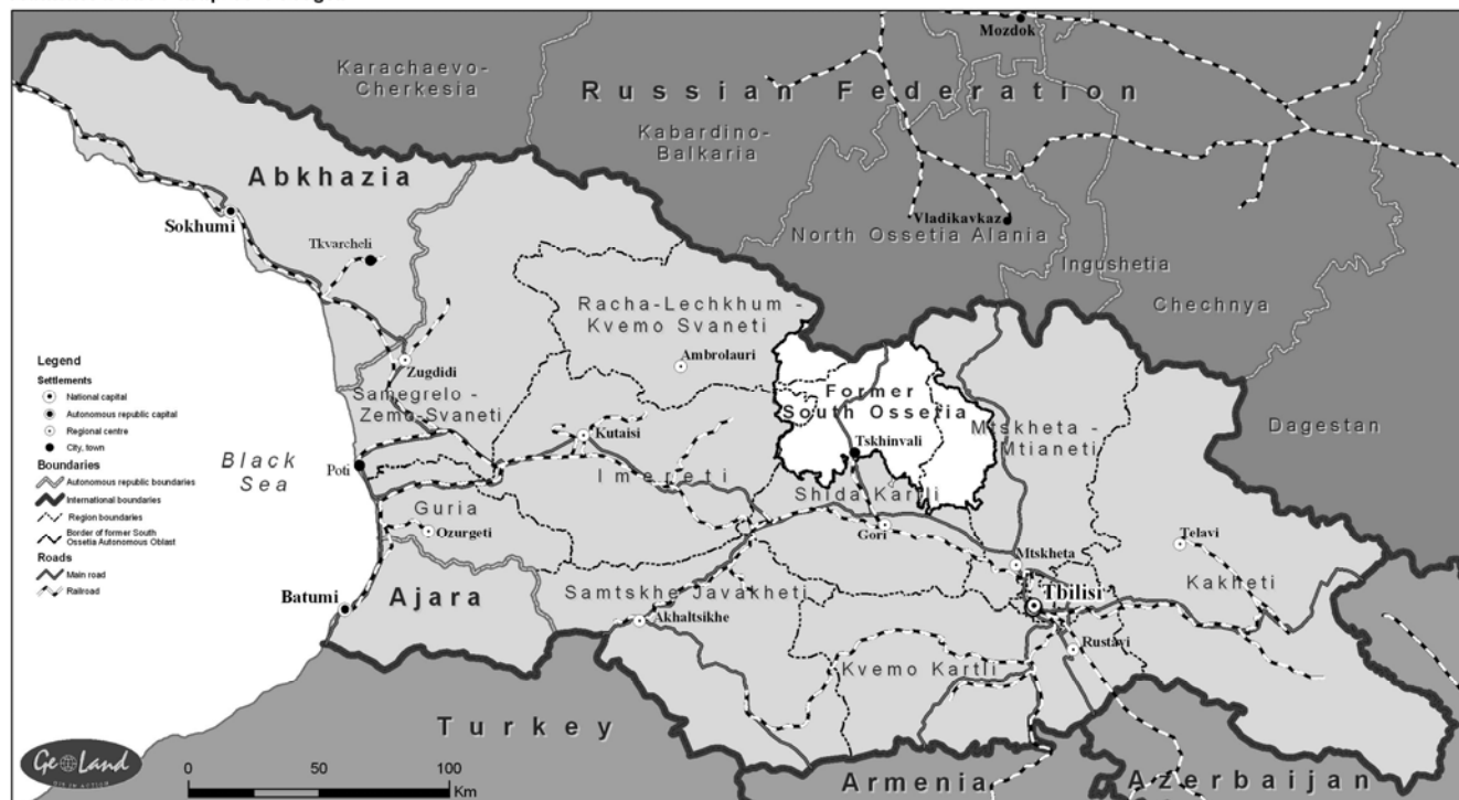
Administrative map of Georgia