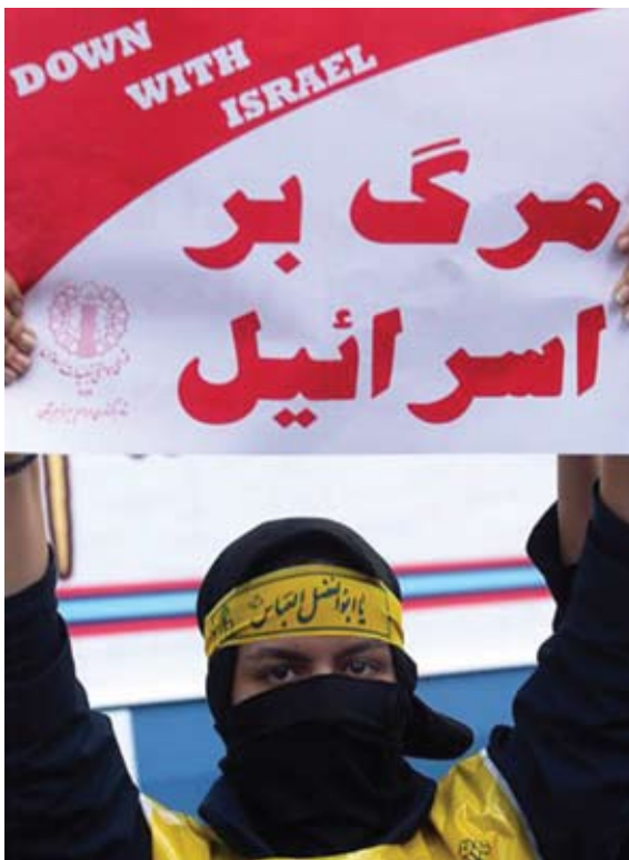
In English: “Down with Israel” In Persian: “Death to Israel”

While the captions of the posters in English read “Down with Esrail [Israel]” and “Down with USA,” the captions in Arabic read “Death to Israel” and “Death to America.”