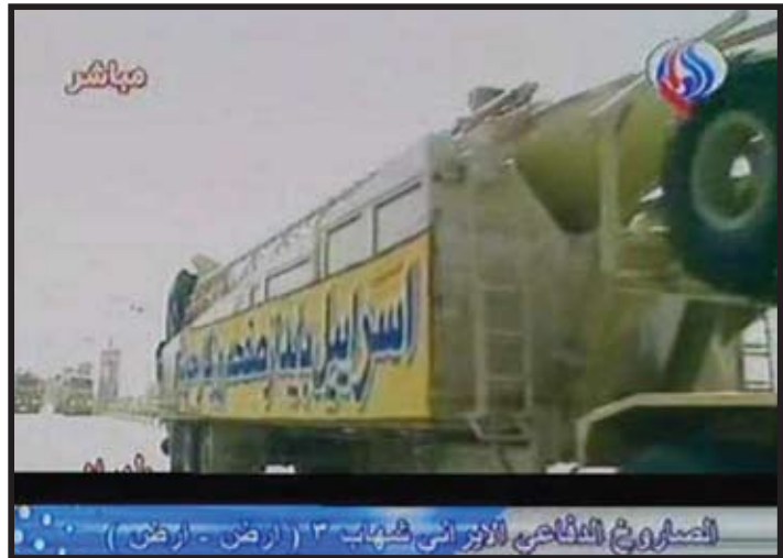
“Israel must be uprooted and wiped off [the pages of] history” - the inscription on a Shahab 3 missile in a military parade in Tehran, September 22, 2003

Even before Ahmadinejad himself spoke about wiping Israel off the map, the Iranian regime used such expressions but did not leave any doubt about what stood behind this phraseology. By juxtaposing its call for Israel's elimination with a Shahab 3 missile during a military parade, the Iranian regime itself has clarified that these expressions about Israel's future do not describe a long-term historical process, in which the Israeli state collapses by itself like the former Soviet Union, but rather the actual physical destruction of Israel as a result of a military strike. The Shahab 3 missile has a range of 1,300 kilometers and can reach Israel from launch points in Iranian territory. Once Iran has completed the production of sufficient quantities of highly enriched uranium – or weapons-grade plutonium – there is no reason why Iran cannot deploy a future Iranian nuclear weapon on a Shahab 3 missile in order to carry out Ahmadinejad's threat to wipe Israel off the map.