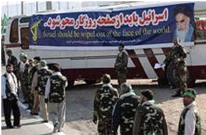
The banner appears as well on a bus at a military rally in Iran in November 2006. The banner reads in English, “Israel should be wiped out of the face of the world.” 30