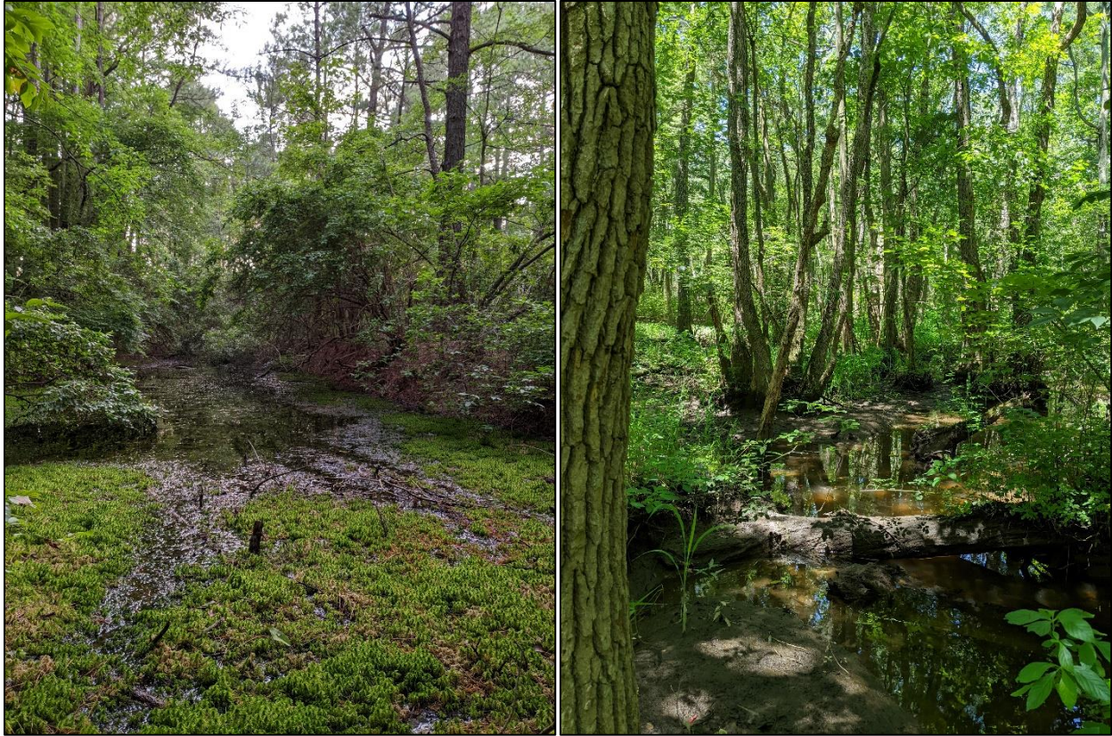
Figure 3. Forested wetland habitats of the mysterious lantern firefly. Note the sphagnum mats in the photo on the left, and the dense vegetation in the photo on the right.

Atlantic white cedar swamps are found in a narrow band along the eastern coastline and Gulf Coast, occurring patchily from Maine to Mississippi (Laderman 1989). On the Delmarva Peninsula, these swamps are found only on the Atlantic Coastal Plain, where they serve as coastal buffer zones and flood control areas, and provide a haven for other rare and imperiled species like Hessel’s hairstreak ( Callophrys hesseli ) and the bald cypress sphinx moth ( Isoparce cupressi ). Atlantic white cedar swamps are characterized by slightly elevated hummocks, where the trees grow, surrounded by hollows that are typically filled with darkly tannic freshwater throughout the growing season (Environmental Protection Agency 2016). Soils are acidic with high levels of organic matter and are characterized by hydrophilic and often rare and unusual plant species (Environmental Protection Agency 2016). Sphagnum mats are common, and can often be found growing over the roots of the cedars (Environmental Protection Agency 2016).