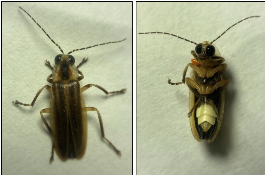
Figure 1. Dorsal (left) and ventral (right) images of an adult male mysterious lantern firefly, Photuris mysticalampas

While mysterious lantern fireflies are similar in appearance to other sympatric Photuris fireflies, including P. pensylvanica , P. hebes , P. eliza , and P. sheckscheri , they can be distinguished from these other species by their small oval-shaped bodies, dense elytral pubescence, specific habitat association, and unique flash pattern (Heckscher 2013; Lloyd 2018). At 8.2-10.55 mm in length, adults are considered small for the Photuris genus (Heckscher 2013). The elytra (modified, hardened forewings found in beetles) range from light brown to gray and the thorax is typically brown (Heckscher 2013).