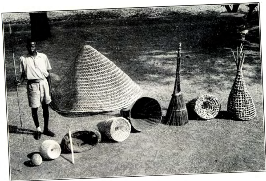
PLATE XXX. Collection of indigenous fishing equipment from the Lake Kyoga area—For description see para. 474.