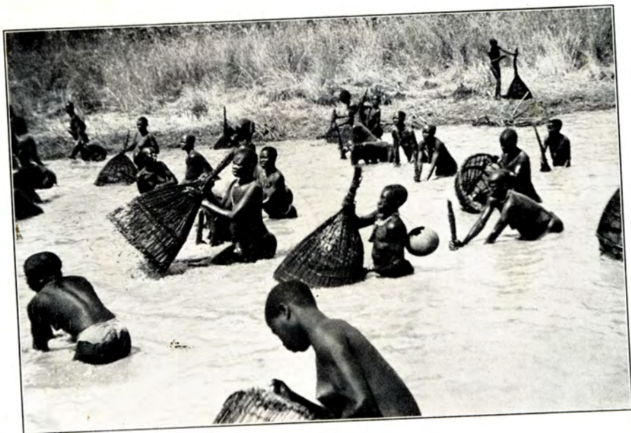
PLATE XXIX. Women fishing in Lango.