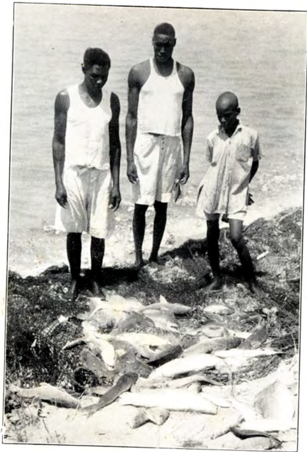
PLATE XXIII. A typical seine net catch at Bulisa, Lake Albert.