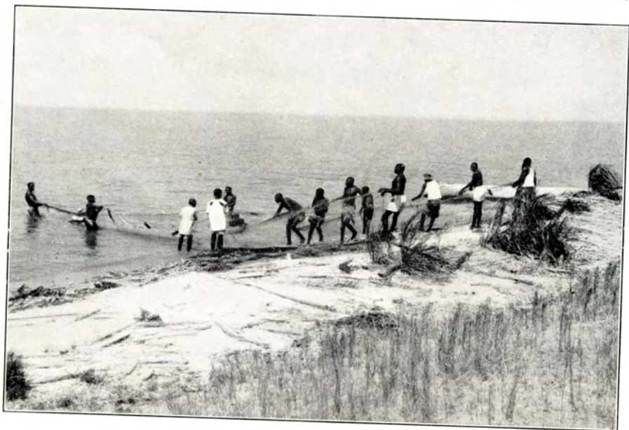
PLATE XXIV. Hauling a seine net at Bulisa, Lake Albert.