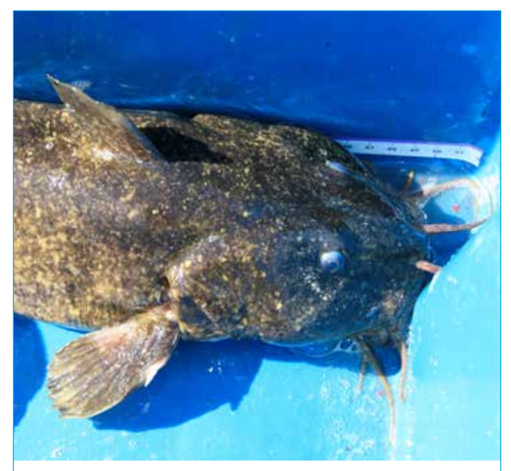
The cobbler has whisker-like barbels to help it find food.

Eutrophication is one of the main causes of hypoxia (low oxygen levels) and anoxia (no oxygen). Eutrophication happens when nitrates and phosphates are added to the water, from fertiliser run-off, for example. This leads to an increase in the growth of plants, especially algae, which can lower oxygen levels.