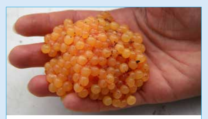
Cobbler produce a small quantity of very large eggs.

Cobbler can complete their lifecycles in marine (ocean) or estuarine waters. The male builds a burrow then lures a female in to lay her eggs. After fertilisation, the male stays in the burrow to protect the eggs while they develop and hatch. The male then continues to protect the young for about a month, until they are developed enough to forage for themselves.