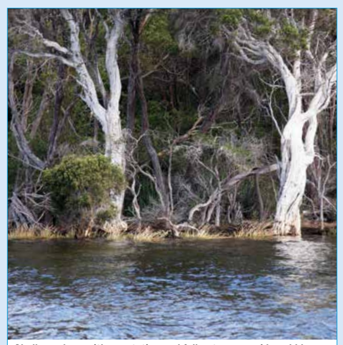
Shallow edges with vegetation and fallen trees provide cobbler with a suitable sheltered habitat for their burrows.

Cobbler reach sexual maturity at about three to four years of age and about 42.5 centimetres in length. Sexual maturity is both age and size dependent. Various conditions in different inlets have been shown to influence growth rates. In some waters a cobbler may be sexually mature at the age of three, while in other waters, they don't reach maturity until five years of age. Cobbler can grow up to 91 centimetres in length, weigh up to 2.5 kilograms and live for 13 years.