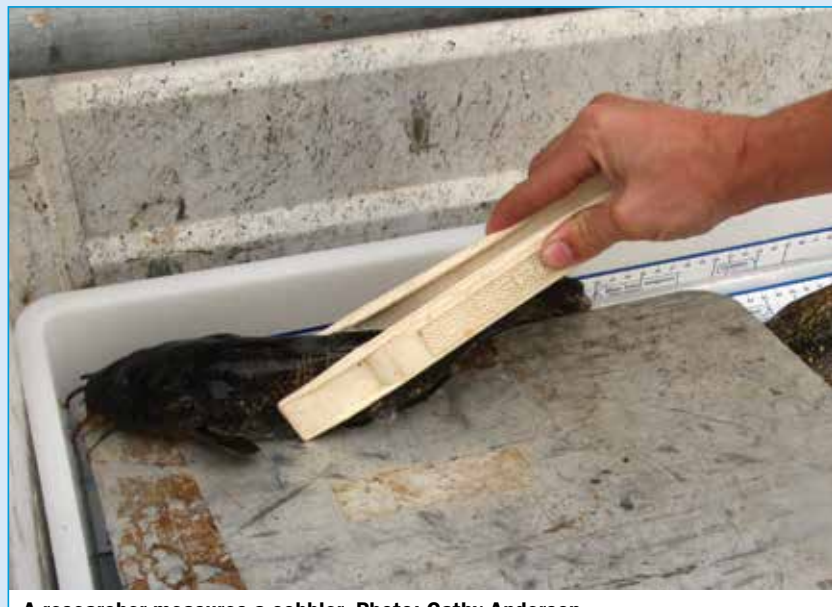
A researcher measures a cobbler.