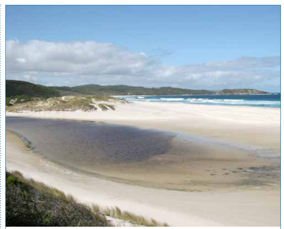
Cobbler thrive in Wilson Inlet, near Denmark, which is not open to the ocean for most of the year.

In areas where the estuary does open to the ocean, like the Swan Estuary, it's believed there are still separate breeding stocks. Historically, it's thought there were two stocks living in the Swan Estuary – the estuarine stock in the upper estuary and an oceanic stock that bred outside of the estuary and then ventured into the lower estuary as juveniles. The estuarine cobbler population in the Swan Estuary dropped to such low levels that, in July 2007, a 10-year fishing ban was implemented in both the Swan and Canning rivers to allow the stock to recover.