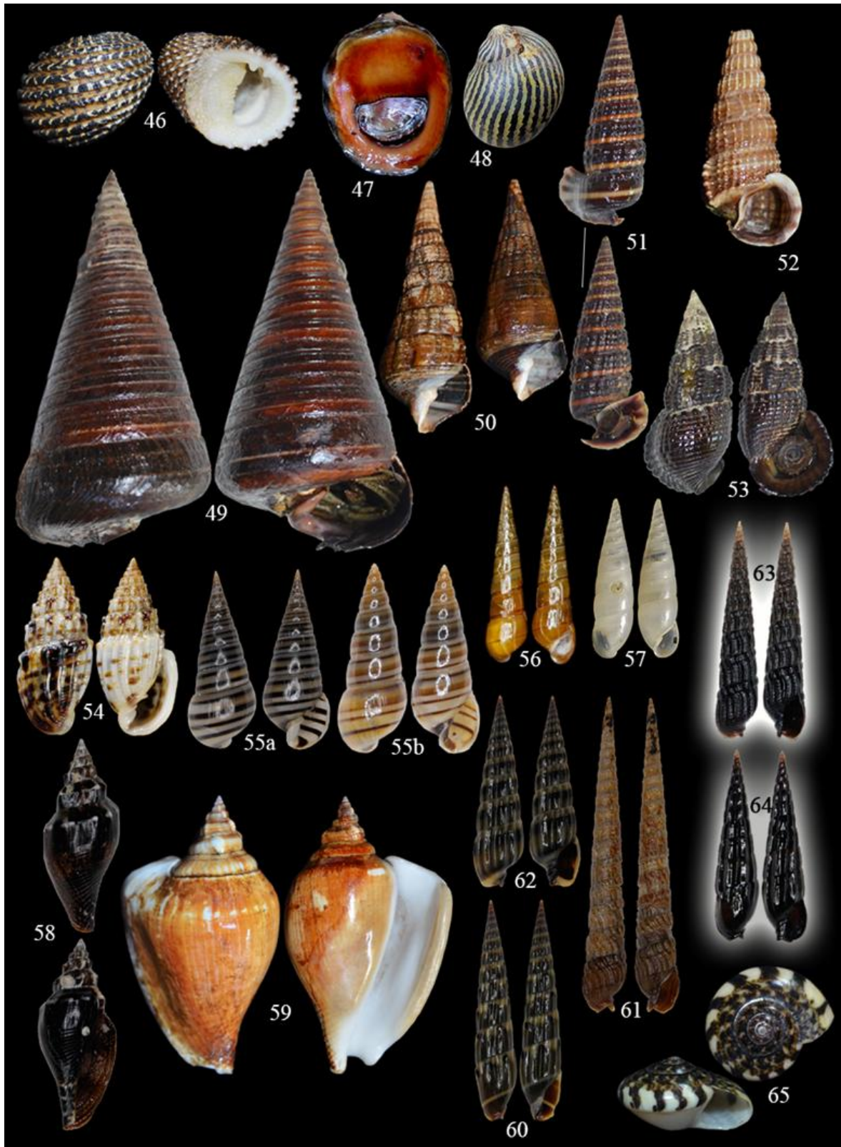
Fig 5: Some species of gastropods encountered in Iwahig River-Estuary, Palawan, Philippines. 46) Nerita exuvia , 47) Nerita violacea , 48) Neritina coromandeliana , 49) Telescopium telescopium , 50) Terebralia palustris , 51) Cerithideopsilla microptera , 52) Cerithidea quadrata , 53) Terebralia sulcata , 54) Otopleura auriscati , 55) Pyramidella dolabrata dolabrata , 56) Syrnola adamsi , 57) Syrnola jaculum , 58) Canarium urceus , 59) Laevistrombus turturella , 60) Hastula matheroniana , 61) Terebra anilis , 62) Terebra plumbeum , 63) Terebra succincta , 64) Terebra swainsoni , 65) Umbonium elegans .