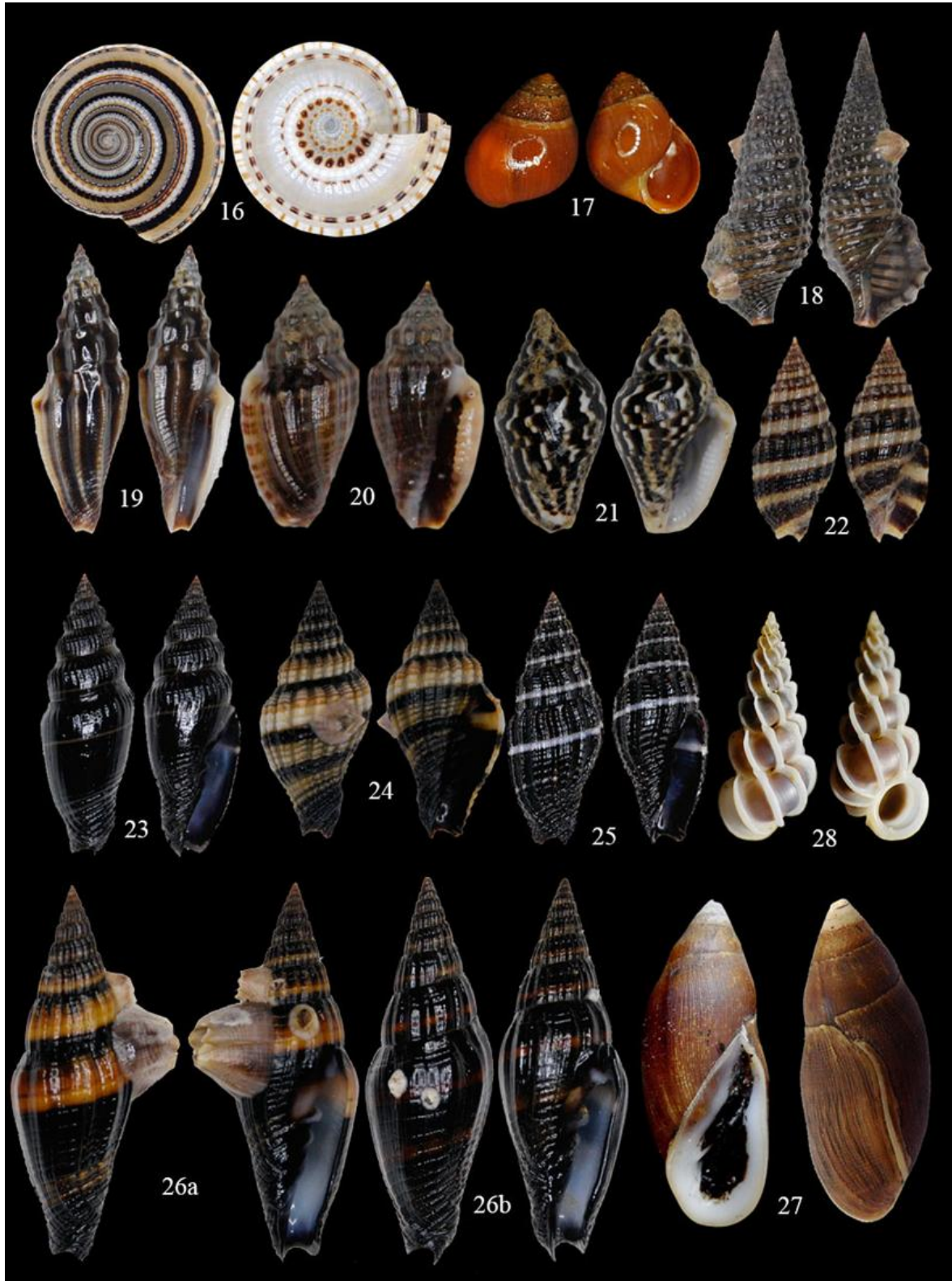
Fig 3: Some species of gastropods encountered in Iwahig River-Estuary, Palawan, Philippines. 16) Architechtonica perspectiva , 17) Assiminea brevicula brevicula , 18) Cerithium coralium , 19) Eucithara stromboides , 20) Eucithara marginelloides , 21) Euplica scripta , 22) Vexillum amandum , 23) Vexillum funereum , 24) Vexillum rugosum , 25) Vexillum virgo , 26) Vexillum vulpecula , 27) Ellobium aurisjudae , 28) Epitonium sandwichensis