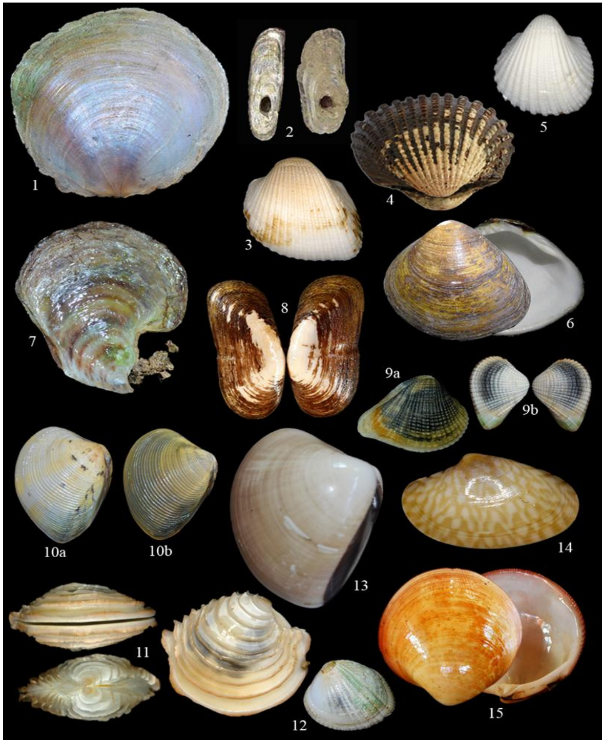
Fig 2: Species of bivalves encountered in Iwahig River-Estuary, Palawan, Philippines. 1) Placuna placentia , 2) Enigmonia aenigmatica , 3) Anadara uropigimelana , 4) Anadara granosa , 5) Potiarca pilula , 6) Polymesoda erosa , 7) Isognomon ehippium , 8) Azorinus coarctatus , 9) Anomalocardia squamosa , 10) Callista erycina , 11) Clausinella chlorotica , 12) Gafrarium pectinatum , 13) Meretrix meretrix , 14) Paphia undulata , 15) Cyclina orientalis .

three habitats. Only two species were displayed for sale at vending stalls.