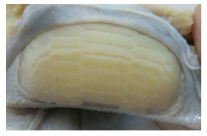
Fig 7: Rhinoptera sewelli- lower jaw 9 series of teeth