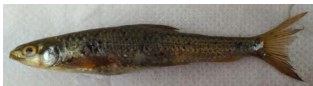
Fig 1: A specimen of Crossocheilus diplochilus from Wular Lake, Kashmir

The condition factor or ponderal index ( K ) for individual fish species was evaluated using the conventional formula described by [13] as: K = W \times 100 / L^3 , Where, K is the condition factor, W is the weight of fish in grams (g) and L is the total length in mm.