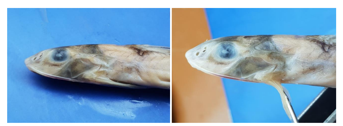
Plate 7: Lateral view showing position of eye and nostril.