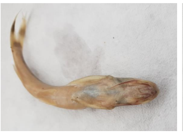
Plate 1: Ventral view of the specimen showing rosy red barbels. Plate 2: Dorsal view of the whole specimen showing saddles.