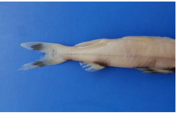
Plate 3: Posterior portion showing adipose fin and caudal fin with blotch.