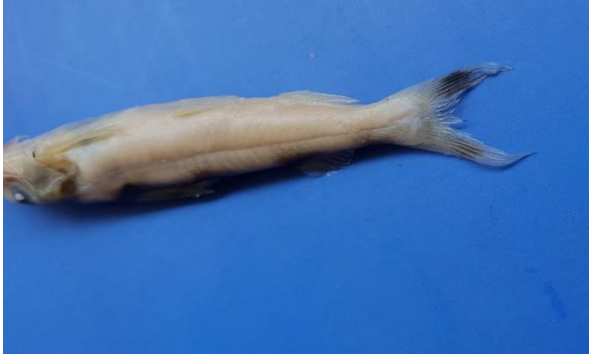
Plate 4: Showing distinct lateral line and extension of saddles and longer upper lobe