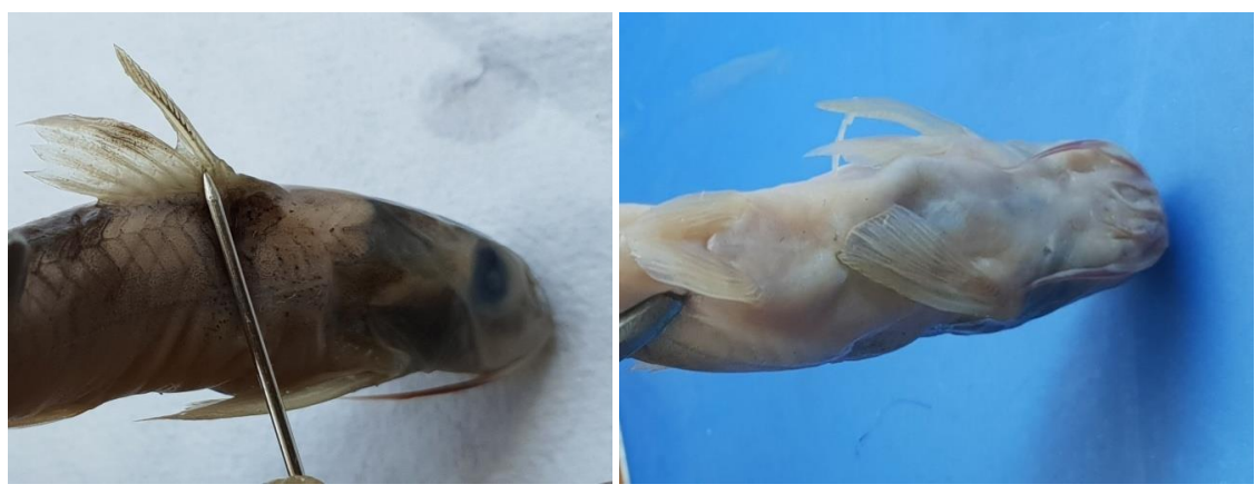
Plate 5: Showing serrated dorsal spine.