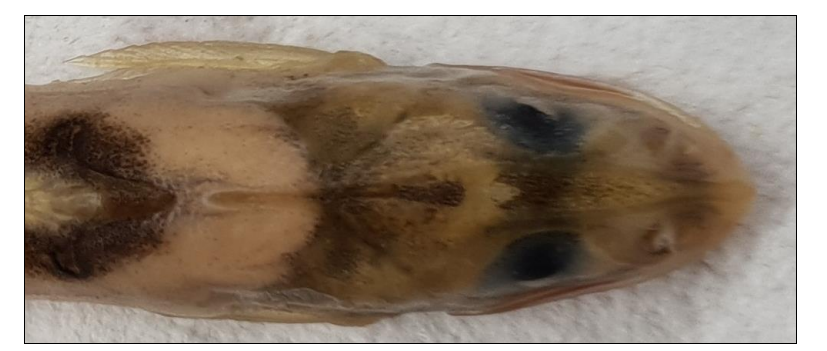
Plate 9: Showing fontanel and occipital process.