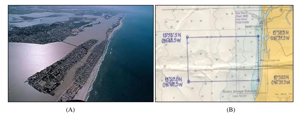
Fig 1: Aerial view of Saint-Louis (A) and geographical coordinates of its MPA (B)

These last shorelines mixed with "joxoor" shell, are suitable for fishing. Indeed, the various natural habitats, in particular rocks, are places of refuge, spawning and growth of fry, mainly demersal species.