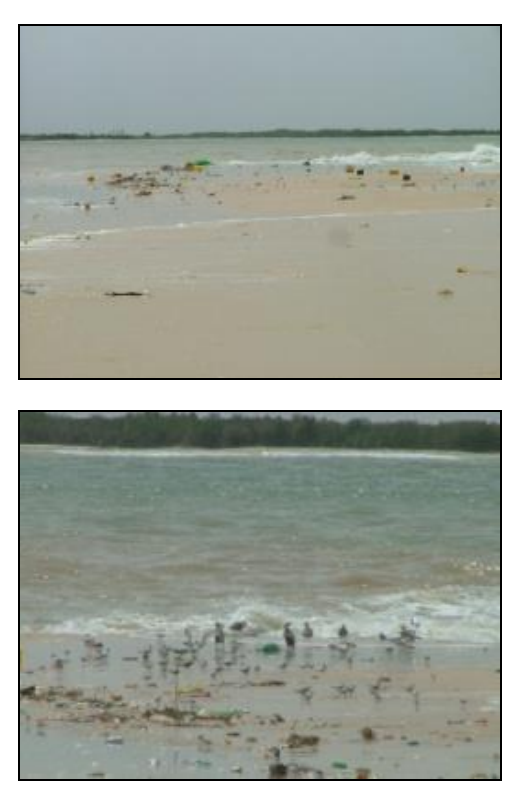
Fig 6: Elements of domestic pollution visible at the Saint-Louis MPA

However, this great anthropic threat could be avoided in the context of the proper application of the environmental and social management plan (PGES) of the oil and gas companies in Saint- Louis and Kayar's areas.