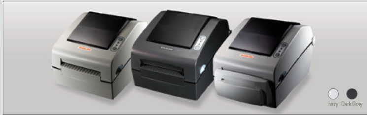
SLP-D420 (Standard Type)