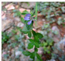
A). Cleome burmannii Wight & Am.