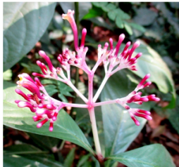
D). Chassalia curviflora (Wall. ex Kurz) Thw.