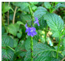
A). Stachytarpheta urticifolia (Salisb.) Sims.