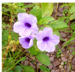
C). Ruellia tuberosa L.