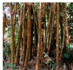
F). Bambusa vulgaris Schrad.