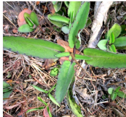
C). Bryophyllum pinnatum (Lam.) Kurz.