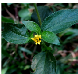
F). Synedrella nodiflora (L.) Gaertn.