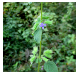
B). Hyptis suaveolens (L.) Poit.