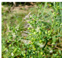
E). Scoparia dulcis L.