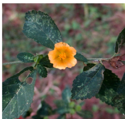
B). Sida acuta Burm. f.