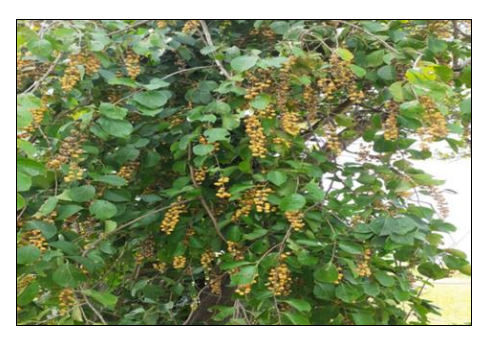
Fig 1: Climbing shrub of Celastrus paniculatus wild

In Ayurveda the Celastrus paniculatus wild mentioned as 'Tree of life', is a member of Celastraceae family. The Celastrus paniculatus seed oil has significant action on CNS <sup>[1]</sup>. The Celastrus paniculatus wild is also known as Intellect tree, Jyotishmati, Malkanguni. It is medicinal plant, found in Sub Himalaya arch up to 2000m in central India, western and Eastern Ghats largest area of Rajmahal hills in Bihar and Orissa up to 1500m altitude. The Celastrus paniculatus oil possess Tranquilizing effect, Central Muscle Relaxant, anti-emetic, anti ulcerogenic and adaptogen with memory enhancing properties. According to traditional system of ancient medicine, Celastrus paniculatus beneficial in appetizer, laxative, emetic, aphrodisiac, brain tonic and used in treatment of leprosy, asthma, cough, paralysis, gout, rheumatism, leucoderma and headache. The bark of Celastrus paniculatus is reported for the causing abortion <sup>[2]</sup>.