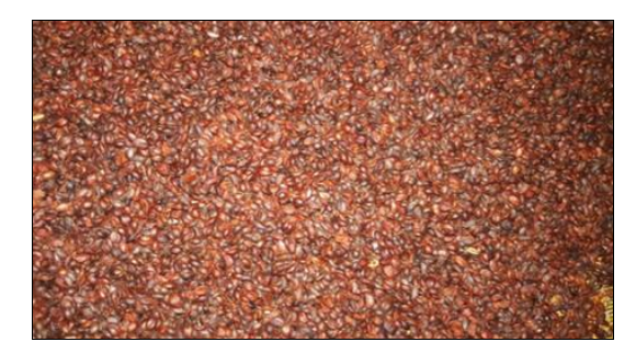
Fig 4: Dried seeds of Celastrus paniculatus wild