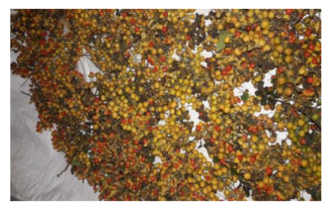
Fig 2: Immature seeds of Celastrus paniculatus wild

Corresponding Author: Sanchita R Dhumal Rajgad Dnyanpeeth's College of Pharmacy Bhor, Pune, Maharashtra, India