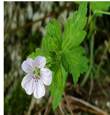
24. Geranium neplense Sweet