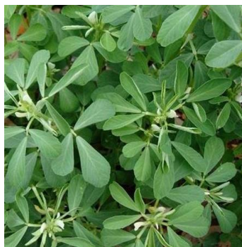
49. Trigonella foenum-graceum Linn.