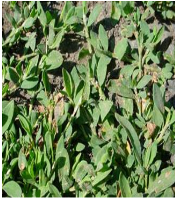
34. Polygonatum verticillatum L.