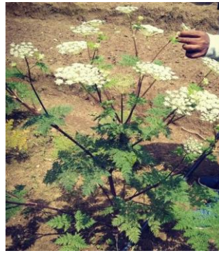
44. Selinum tenuifolium Wallich ex C.B. Clarke