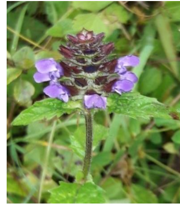
36. Prunella vulgaris L.