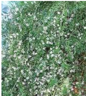
11. Asparagus abscondens Roxb.