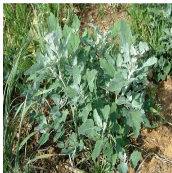
16. Chenopodium album Linn.