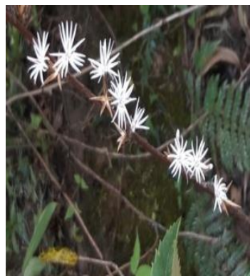
6. Ainsliaea aptera DC