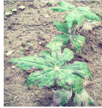
33. Podophyllum hexandrum Royle