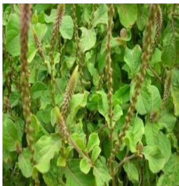
1. Achyranthes aspera L.