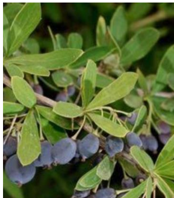
13. Berberis lycium Royle