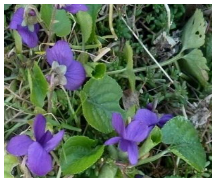
53. Viola concecens Wall.