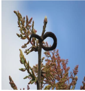
32. Pistacia integerrima