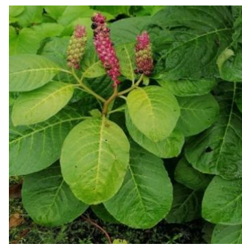
30. Phytolacca acinosa Roxb.