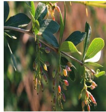
12. Berberis asiatica Roxb. ex. DC.