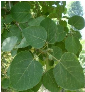
22. Ficus palmate Forsskal