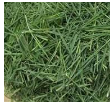
18. Cynodon dactylon (L.) Persoon