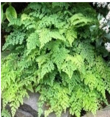
4. Adiantum venustum G. Don.