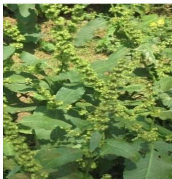
41. Rumex nepalensis Sprengel