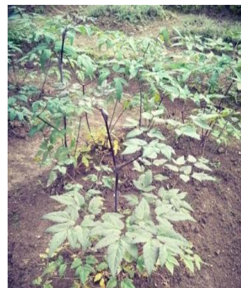
9. Angelica glauca edgew.