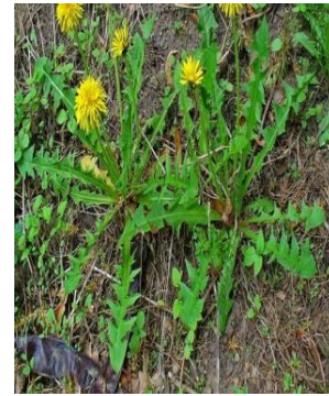
45. Taraxacum officinalis Wigg.