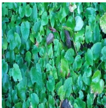
52. Valeriana wallichii Wall.