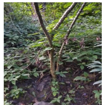
54. Zanthoxylum armatum DC