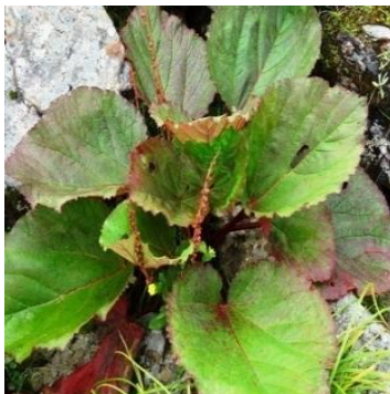
37. Rheum moorcroftianum D. Don.