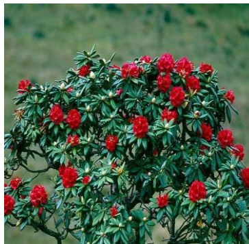
38. Rhododendron arboreum Sm.