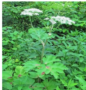
26. Herbacleum lanatum Michx