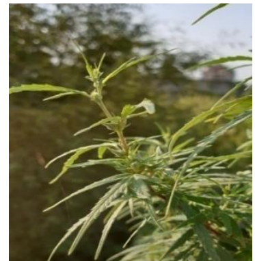
15. Cannabis sativa Linn.