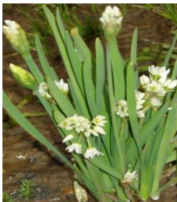
8. Allium humile Kunth.