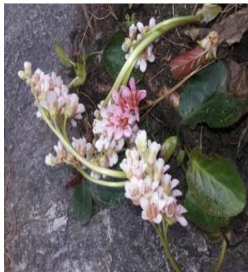
14. Bergenia ciliate (How.) Sternb