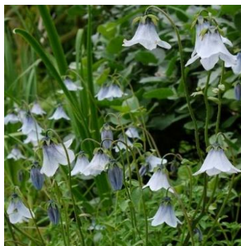
17. Codonopsis ovate Benth and Codonopsis rotundifolia Benth.