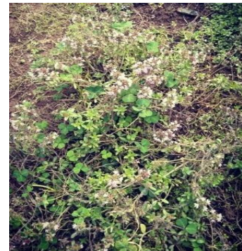
48. Thymus serpyllum Linn.