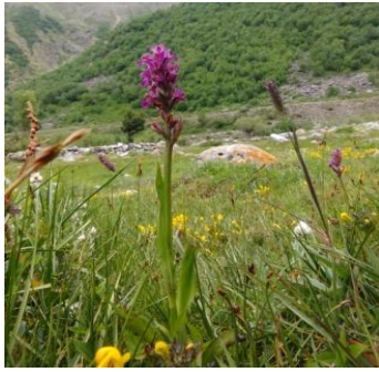
19. Dactylorrhiza hatagirea (D. Don.) Soo