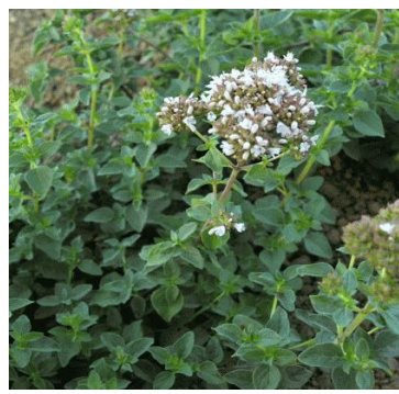
29. Origanum vulgare Linn.