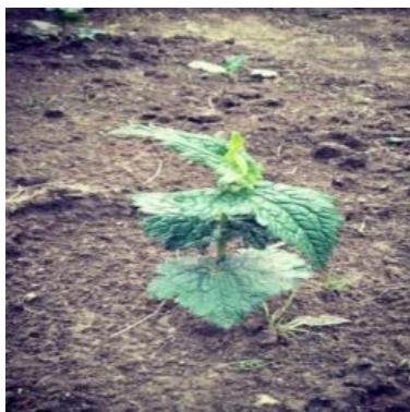
2. Aconitum heterophyllum Wall.