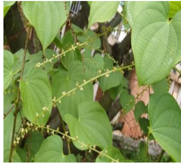
20. Dioscoria deltoidea Wall. ex Kunth.