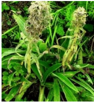
10. Arnebai benthami Wall.