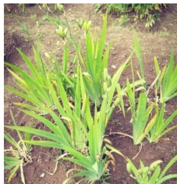
3. Acorus calamus Linn.