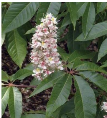
5. Aesculus indica Colebr.