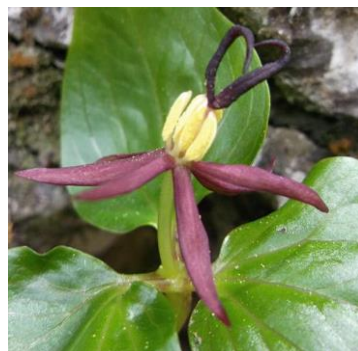
50. Trillidium govianianum (D. Don.) Kunth.