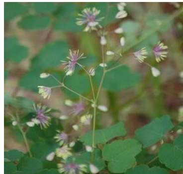
47. Thalictrum foliolosum DC