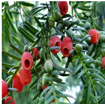
46. Taxus baccata Zucc.