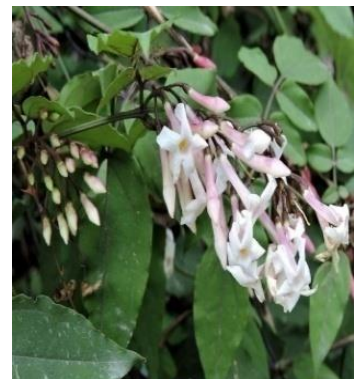
27. Jasminum dispernum Linn.