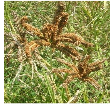
21. Eleusine coracana Gaertn.