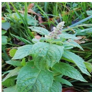
28. Mentha longifolia (L.) Hudson.