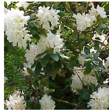
39. Rhododendron campanulatum D. Don.