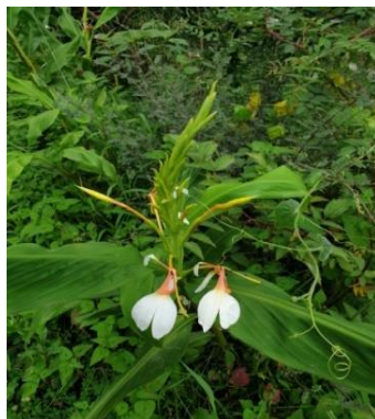
25. Hedychium spicatum Buch.