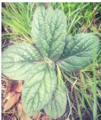
7. Ajuga bracteosa Wall. ex Benth.