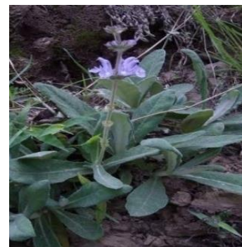
42. Salvia moorcroftiana Wall. ex Benth.