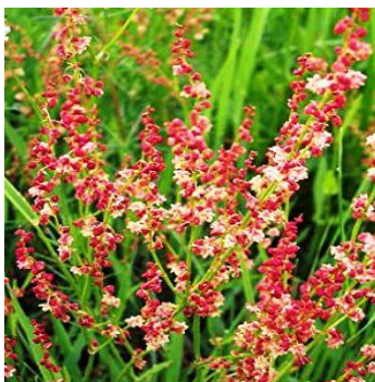
40. Rumex hastatus D. Don