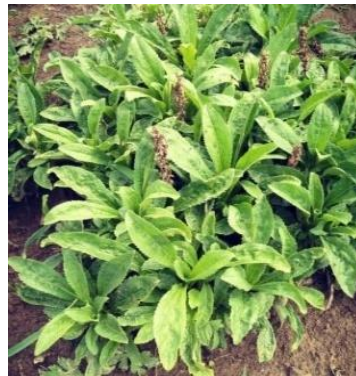
23. Genatian kurroo Royle