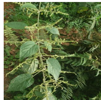
51. Urtica dioica Subsp.