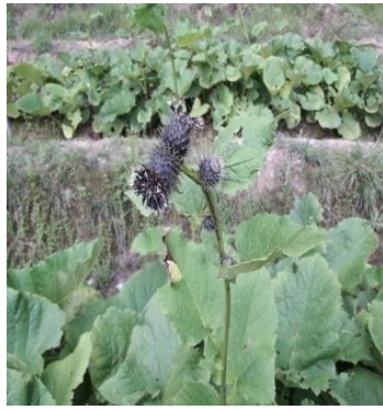
43. Saussurea costus (Falc.) Lipsch.