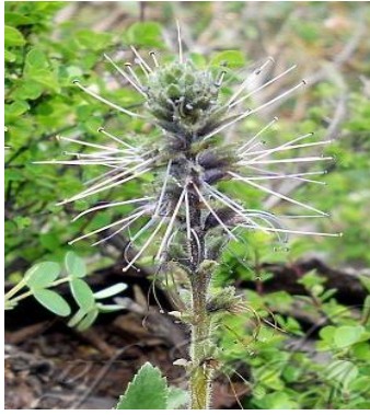
31. Picrorrhiza kurrooa Royle.