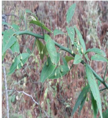
35. Prinsepia utilis Royle