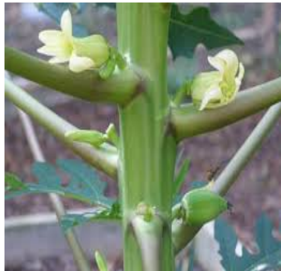
Fig 3: Carica papaya flowers

Papaya plants are dioecious or hermaphroditic, producing only male, female or bisexual (hermaphroditic) flowers. Papaya are sometimes said to be “trioecious” meaning that separate plants bear either male, female, or bisexual flowers (Fig. 3). Female and bisexual flowers are waxy, ivory white, and borne on short peduncles in leaf axils, along the main stem. Flowers are solitary or small cymes of 3 individuals. Ovary position is superior. Prior to opening, bisexual flowers are tubular, while female flowers are pear shaped. Since, bisexual plants produce the most desirable fruit and are self-pollinating, they are preferred over female or male plants. A male papaya is distinguished by the smaller flowers borne on long stalks. Female flowers of papaya was pear shaped, when unopened whereas, bisexual flowers are cylindrical [4].