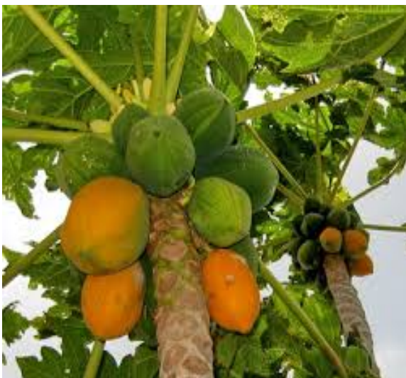
Fig 1: Carica papaya plant

Papaya plant is a large, single-stemmed herbaceous perennial tree having 20–30 feet height (Fig. 1). The leaves are very large (upto 2½ feet wide), palmately lobed or deeply incised with entire margins and petioles of 1-3 feet in length. Stems are hollow, light green to tan brown in color with diameter of 8 inches and bear prominent of scars [4].