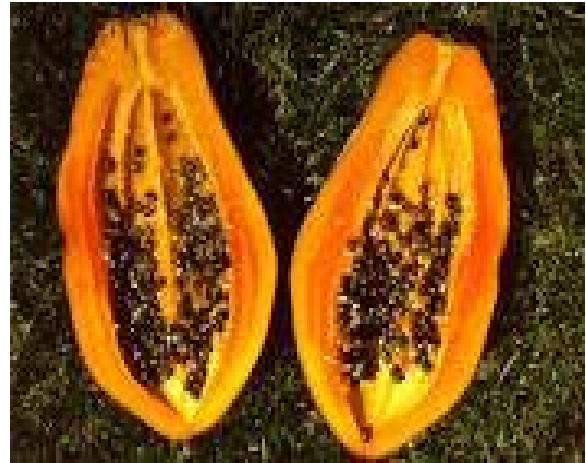
Fig 2: Carica papaya fruit

The fruits are big oval in shape and sometimes called pepo-like berries, since they resemble melon by having a central seed cavity (Fig. 2). Fruits are borne axillary on the main stem, usually singly but sometimes in small clusters. Fruits weigh from 0.5 up to 20 lbs, and are green unlike ripe, turning yellow or red orange. Flesh is yellow-orange to salmon (pinkish-orange) at maturity. The edible portion surrounds the large central seed cavity. Individual fruits mature in 5-9 months, depending on cultivator and temperature. Plants begin bearing fruits in 6-12 months [4].