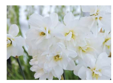
Albus Plenus Odoratus