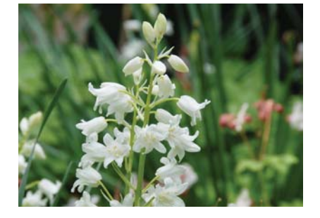
Hyacinthoides hispanica wit