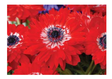
Anemone coronaria Governor