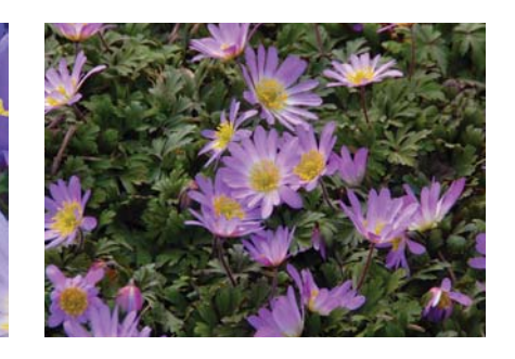
Anemone blanda Charmer