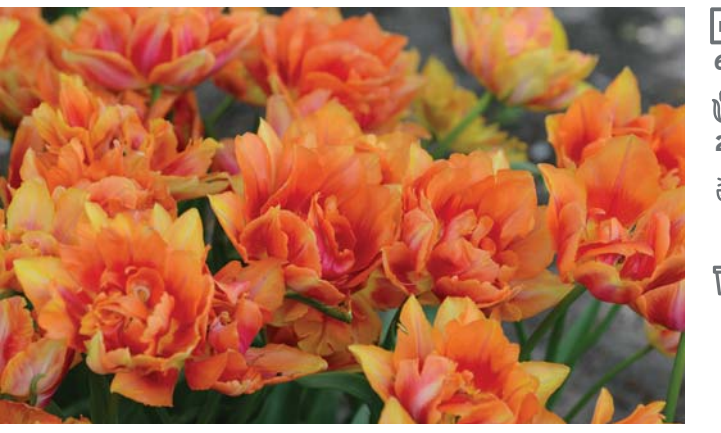
Willem van Oranje