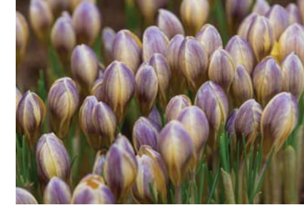
Crocus chrysanthus Advance