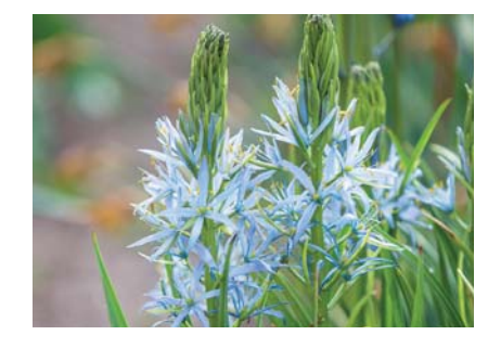
Camassia leichtlinii Blue Heaven