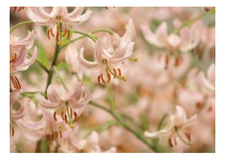
Lilium martagon Pink Morning

Lilium martagon Orange Marmalade M<sup>2</sup> ;ö: ۲. Ø 77 20 80 7