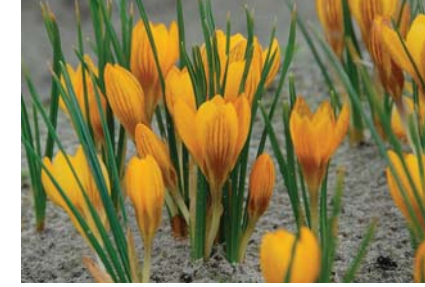
Crocus chrysanthus Dorothy