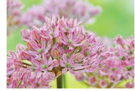
Allium nigrum Pink Jewel®