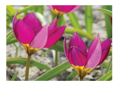
humilis Persian Pearl