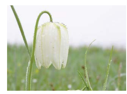
Fritillaria meleagris Alba

M<sup>2</sup> ↓ <sup>4</sup> ♦ <sup>4</sup> ↓ <sup>4</sup> ♦ <sup>4</sup> 100 25 4