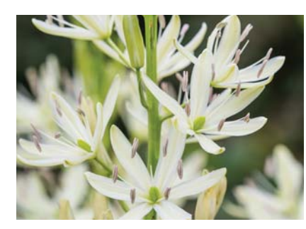
Camassia leichtlinii Alba