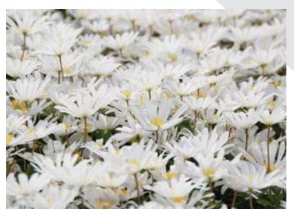
Anemone blanda White Splendour M<sup>2</sup> W S C T