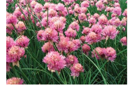
Allium schoenoprasum Forescate