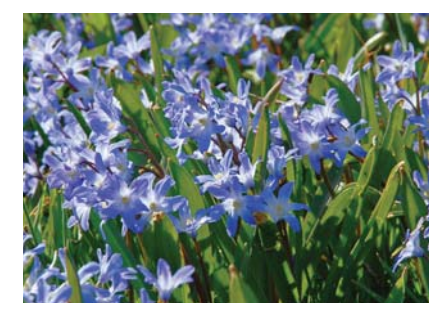
Chionodoxa forbesii Blue Giant