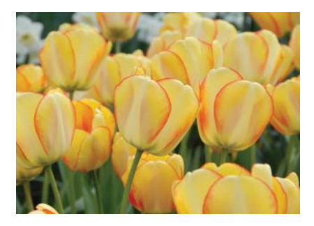
Beauty of Spring®