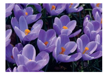
Crocus vernus Remembrance

M<sup>2</sup> ↓ A<sup>4</sup> A<sup>4</sup> ↓ A<sup>4</sup> 150 15 3