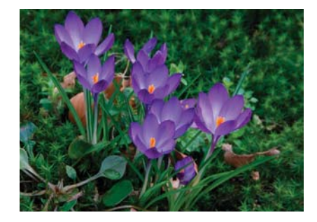
Crocus tommasinianus Ruby Giant M<sup>2</sup> V R C C