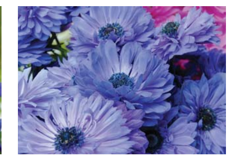
Anemone coronaria Lord Lieutenant M<sup>2</sup> W<sup>↑</sup> S<sup>↔</sup> 150 25 5