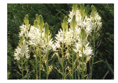
Camassia leichtlinii Sacajawea