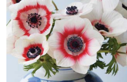
Anemone coronaria Bicolor