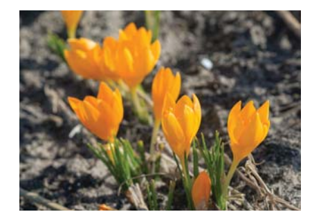
Crocus flavus ssp. flavus

M<sup>2</sup> V<sup>2</sup> ∛ 4 √ 4 200 10 3