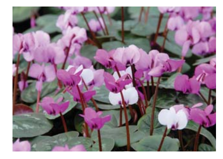
Cyclamen coum hybrids