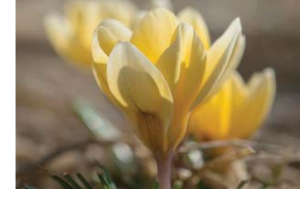
Crocus chrysanthus Romance