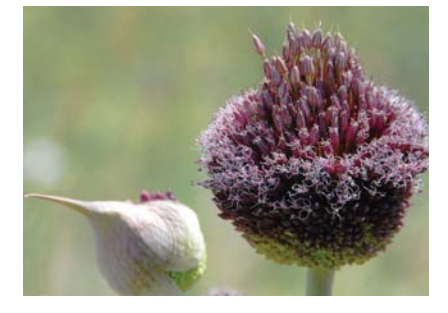
Allium amethystinum Forelock

M<sup>2</sup> V<sup>1</sup> A<sup>2</sup> ∠ A<sup>2</sup> 100 30 6-7