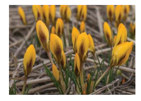
Crocus chrysanthus Goldilocks