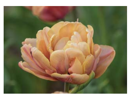
La Belle Epoque®