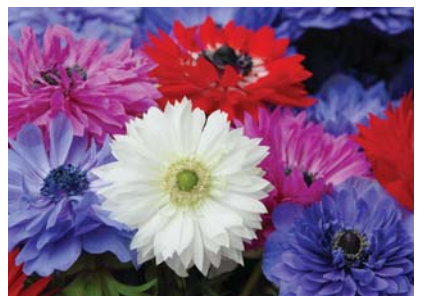
Anemone coronaria St. Brigid