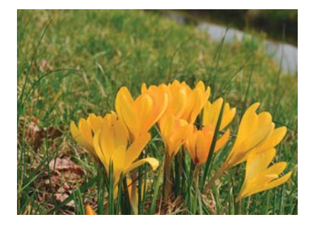
Crocus flavus Golden Yellow

Image: Market with a state Image: Market with a state 150 15