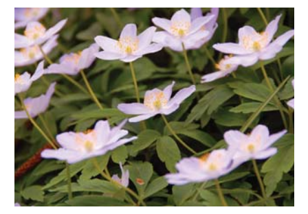
Anemone nemorosa Robinsoniana

M² V I I I I I I I I I I I I I I I I I I I I I I I I I I I I I I I I I I I I I I I I I I I I I I I I I I I I I I I I I I I I I I I I I I I I I I I I I I I I I I I I I I I I I I I I I I I I I I I I I I I I I I I I I