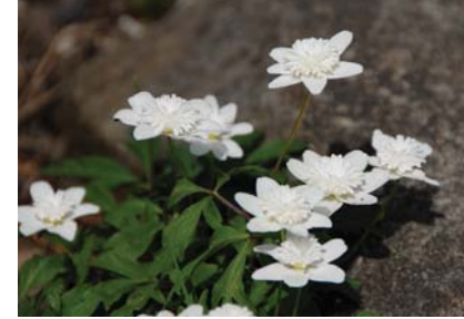
Anemone nemorosa Vestal