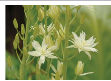
Camassia leichtlinii Semiplena