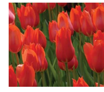
Temple of Beauty®