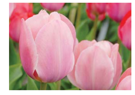
Mystic van Eijk®