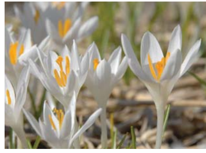
Crocus tommasinianus Albus