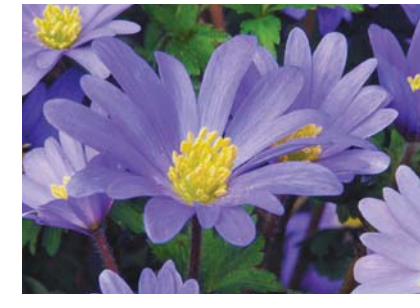
Anemone blanda Blue Shades