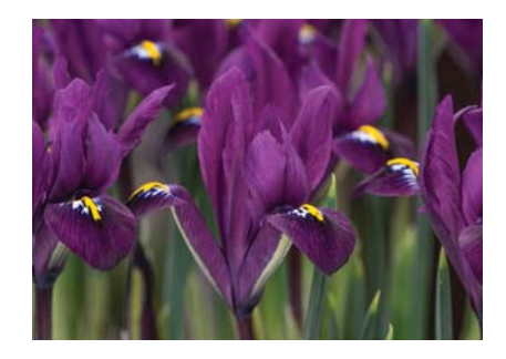
Iris reticulata Purple Hill®