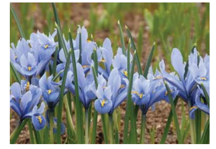
Iris reticulata Alida®