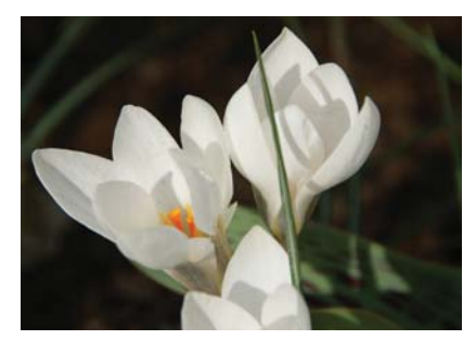
Crocus biflorus Miss Vain