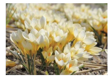
Crocus chrysanthus Cream Beauty