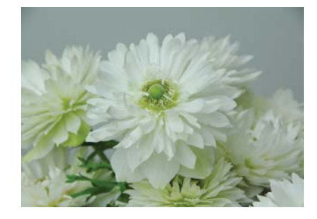
Anemone coronaria Mount Everest M<sup>2</sup> ∰ Ğ 150 25 5