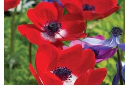
Anemone coronaria Hollandia