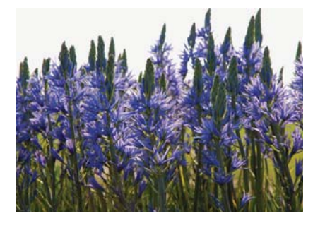
Camassia leichtlinii Caerulea