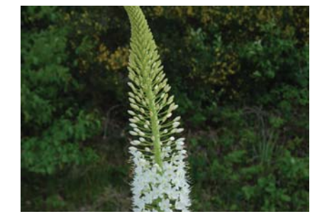
Eremurus White Beauty Favourite®