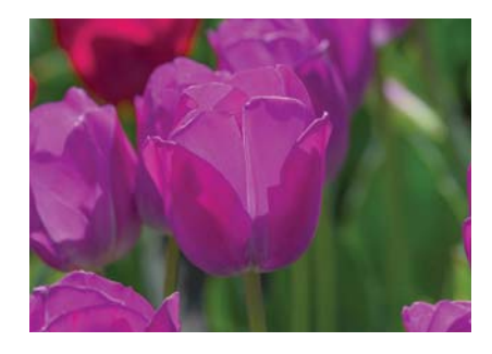
M² ♥↑ 🔅 70 50 4