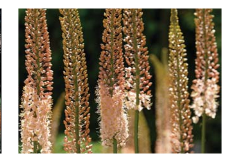
Eremurus isabellinus Romance