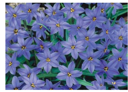
Ipheion uniflorum Jessie