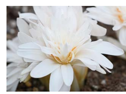
Colchicum autumnale Album