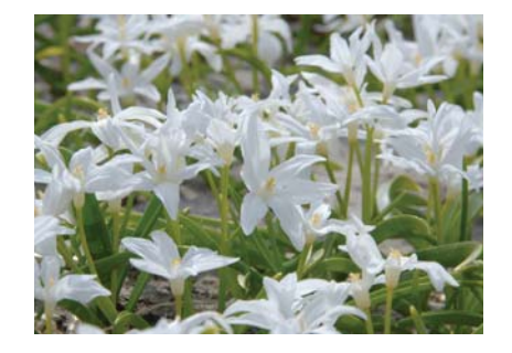
Chionodoxa luciliae Alba