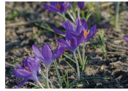
Crocus tommasinianus Whitewell Purple M<sup>2</sup> V S C S 200 10 3