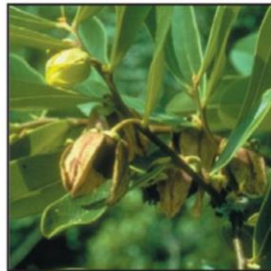
Ann F. Johnson

Field Description: Deciduous shrub 3 - 15 feet tall, with one to several arching stems. Leaves 2 - 5 inches long, yellow-green, leathery, alternate, wider above the middle, with pointed tips, aromatic; network of veins visible on both upper and lower leaf surfaces; leaves all in the same plane, producing a frond-like branch. Flowers 0.5 - 1 inch across, nodding on long stalks in the angle between new leaves and the stem, foul-smelling; most flowers have 4 sepals and 4 or 6 maroon petals ; if six petals, then the 3 outer petals are longer and paler than the inner. Fruits 2 - 5 inches long, lumpy and bean-shaped, with shiny, brown seeds 0.5 inch long.