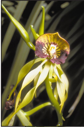
Billy B. Boothe