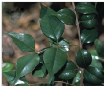
Eugenia confusa