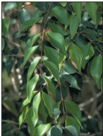
Eugenia rhombea