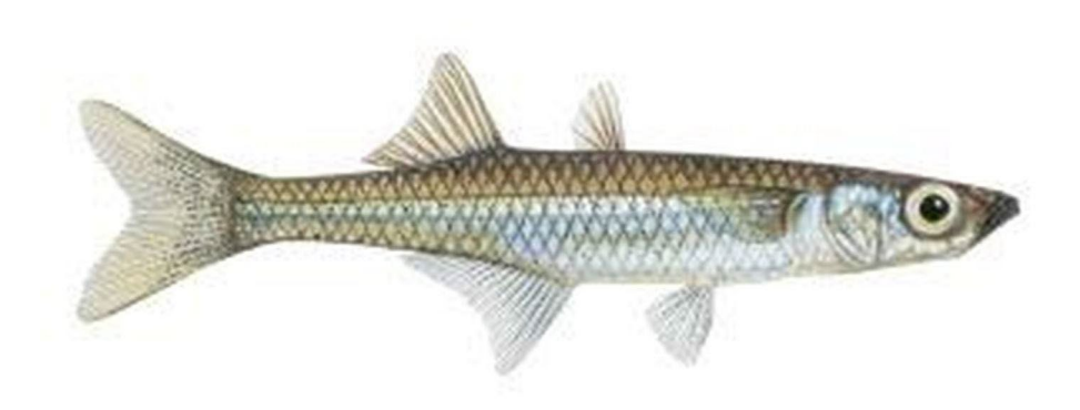
Menidia beryllina (very similar in appearance to key silverside) © Joe Tomelleri