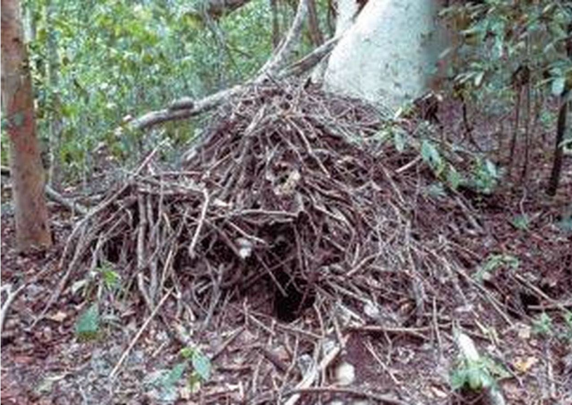
nest