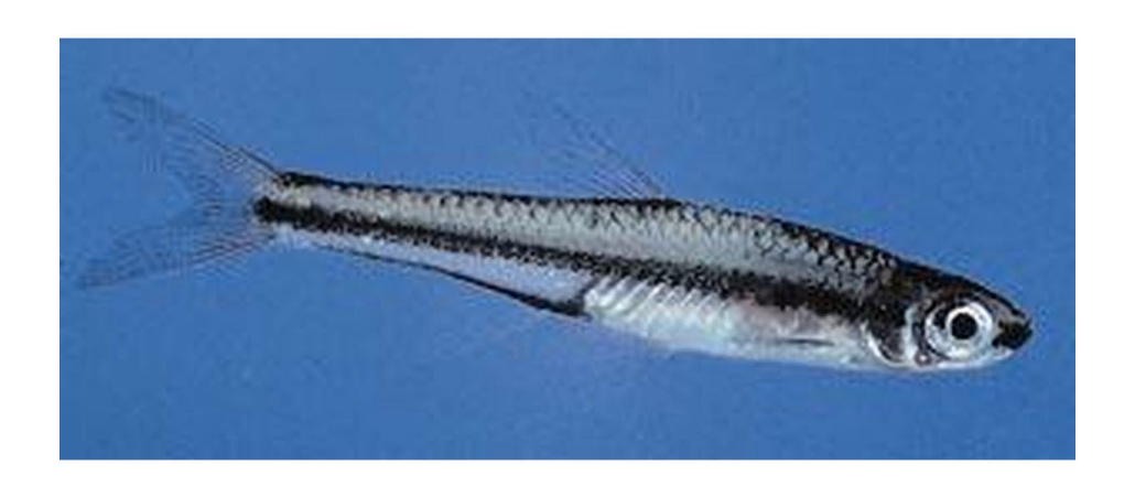
© Gray Bass courtesy of Florida Fish and Wildlife Conservation Commission

References: Bortone 1989, Bortone 1993, Gilbert (ed.) 1992, Hoehn 1998, Page and Burr 1998.