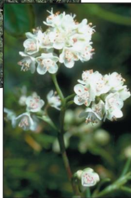
Billy B. Boothe

Field Description: Low shrub with sprawling, zigzag branches , rooting at nodes and forming low mats; branches with reddish-brown, cracked bark. Leaves tiny, needle-like, with ocrea (papery sheaths) surrounding the stems; ocrea without bristles. Flowers very small, with 5 showy, white sepals and no petals, in clusters at ends of erect branches.