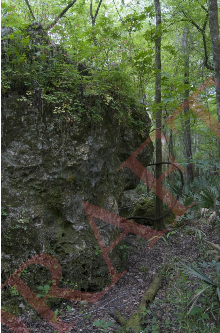
Florida Caverns State Park (Jackson County)