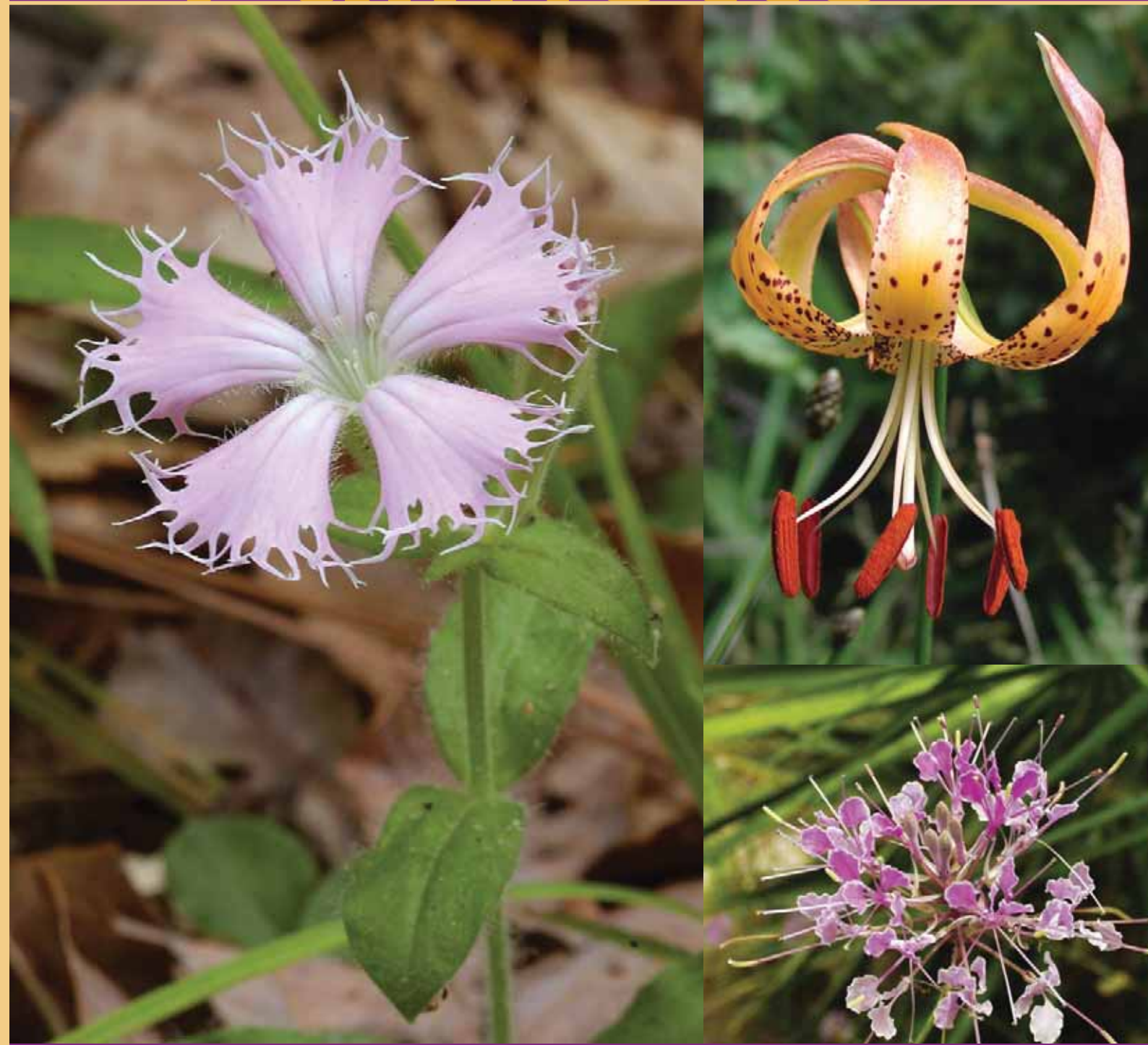
Florida's Endangered and Threatened Plants: Jewels of the Ridge - Silene polypetala - Lilium irridollae