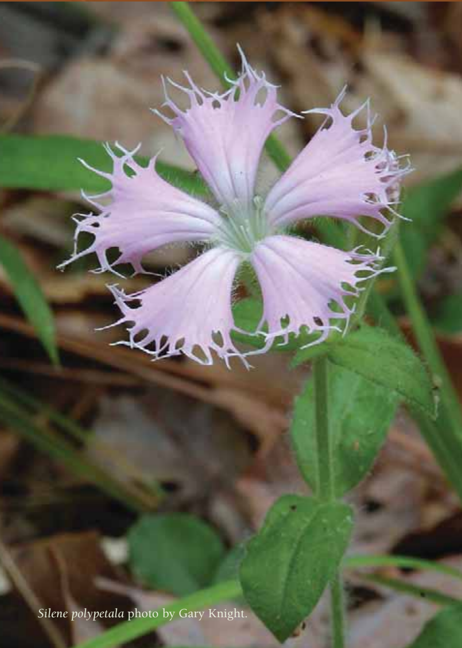
Silene polypetala photo by Gary Knight.