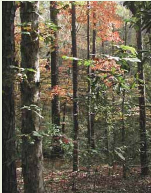
Slope forests exhibit one of the highest species diversities in Florida largely due to their mix of cold temperate and warm temperate species.

and ravines (Florida Natural Areas Inventory and Florida Department of Natural Resources 1990). Soils are generally sands, sandy-clays, or clayey-sands with substantial organics and occasional limestone outcrops. Slope forests exhibit one of the highest species diversities in the state, largely because of their mixture of cold temperate (e.g., beech ( Fagus grandifolia ), white oak ( Quercus alba )) and warm temperate (e.g., southern magnolia ( Magnolia grandiflora )) species. Tree density is relatively high. Such forests are very sensitive communities whose delicate microclimate can be easily disturbed by timber harvests which open the canopy, or by hydrological manipulations which affect seepage and surface water sources. Their steep slopes quickly erode when unvegetated.