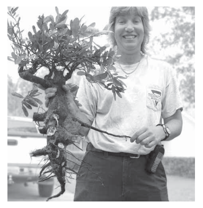
FIG. 3. Digging up Deeringothamnus pulchellus from a threatened area.

Ultimately, both species of Deeringothamnus can only be preserved through acquisition and proper management of their habitats. We need to learn more about maintaining and enhancing the populations. If fire is not feasible, roller chopping or mowing may be beneficial in suppressing competition and enhancing flower production (Helkowski and Norman 1997). Our experiments indicate that hand cross pollination enhances fruit and seed production (Norman 2003), but we also found that such seeds germinated only half as often as seeds from open-pollinated flowers (Norman 3003). Transplanting is a difficult process as Deeringothamnus have a large tap root. [Fig. 3] Plants must be removed quickly and not allowed to dry out before replanting. Success requires enough rain (but not too much), so plants can become established. Most successes in transplanting and seed germination have been obtained when Deeringothamnus are planted in a field