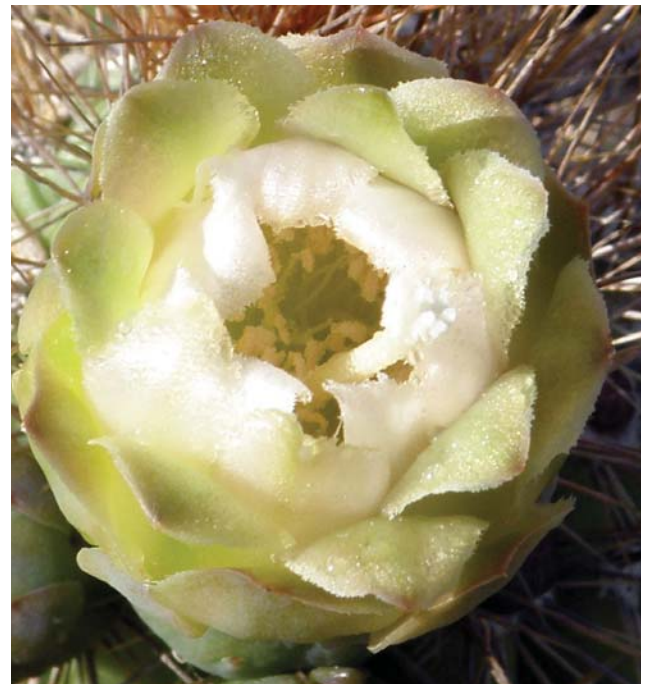
Above: Pilosocereus robinii in bloom at the Center for Tropical Conservation.

Biological systems around the globe are being threatened by human-induced landscape changes, habitat degradation and climate change (Barnosky et al. 2011; Lindenmayer & Fischer 2006; Thomas et al. 2004; Tilman et al. 1994). Although there is a considerable threat across the globe, numerically the threat is highest in the biodiversity hotspots of the world. Of those hotspots, South Florida and the Caribbean are considered in the top five areas for conservation action because of the high level of endemism and threat (Myers et al. 2000). South Florida contains roughly 125 endemic species and is the northernmost limit of the distribution of many tropical species (Abrahamson 1984; Gann et al. 2002). The threat to these species comes predominantly from sea level rise, which could be >1 m by the end of the century (Maschinski et al. 2011).