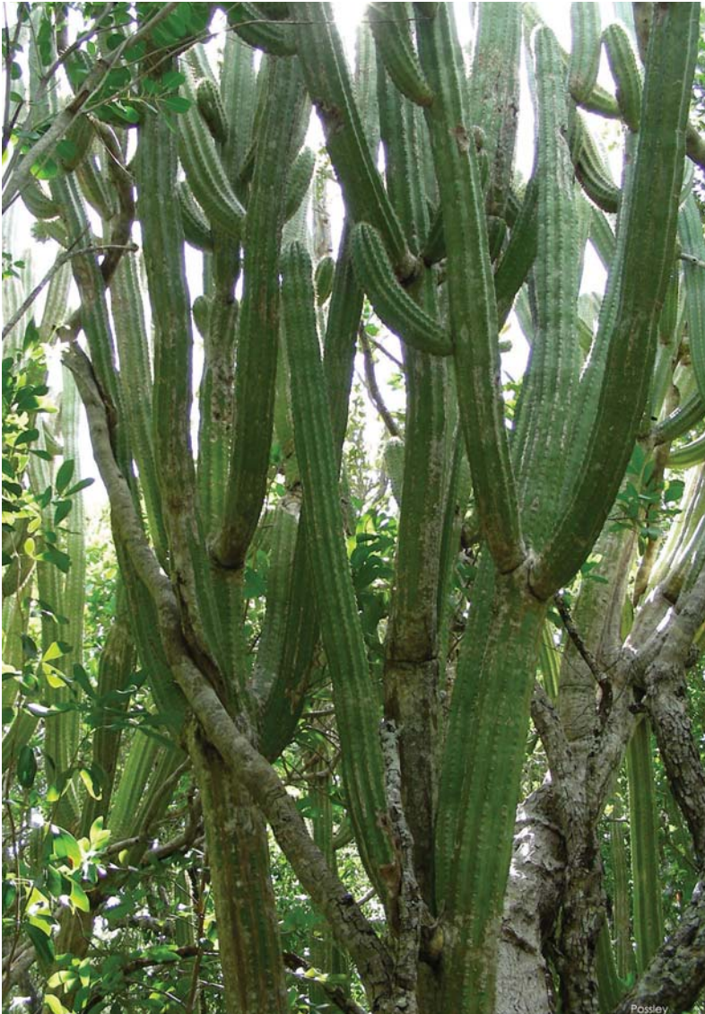
Above: Pilosocereus robinii stand in the Florida Keys.