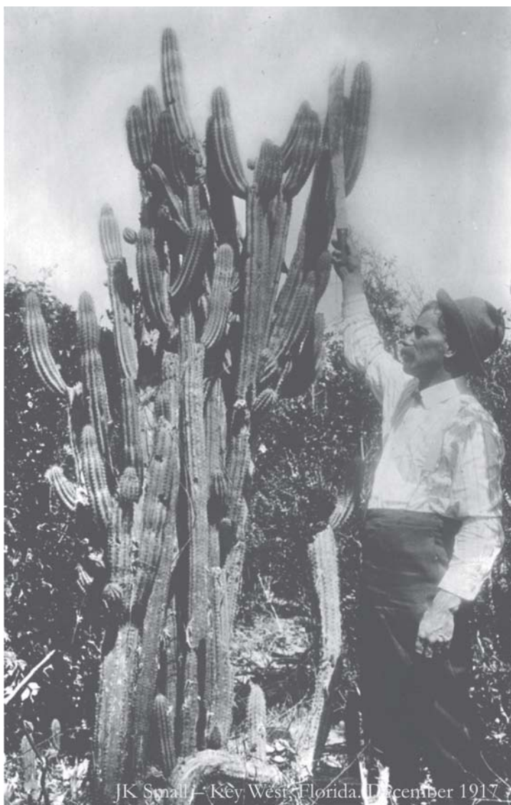
Man standing by * Cephalocereus keyensis 1917 (*later renamed Pilosocereus robinii ).

soil water salinization (Goodman et al. 2012; USFWS 2010). The tropical hardwood hammocks of the Florida Keys are found on limestone outcroppings that represent the areas of highest elevation on the islands. These forests harbor a large number of endemic populations from the Caribbean region. Tropical hardwood hammocks are threatened currently and historically by urbanization, anthropogenically-induced change in fire frequency, conversion to agriculture, and climate change (Harveson et al. 2007; Ross et al. 2001; Ross et al. 2009; USFWS 1999). Rising sea level is of particular concern and, coupled with a recent increase in storm frequency and intensity, is predicted to have a potentially devastating impact on the small remaining populations in the Florida Keys (Maschinski & Haskins 2012; Maschinski et al. 2011).