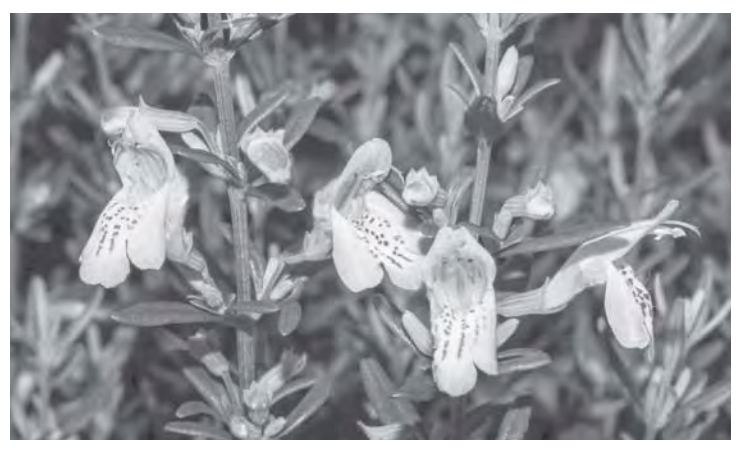
Conradina etonia.

Levin, D. 2002. Hybridization and extinction: in protecting rare species, conservationists should consider the dangers of interbreeding, which