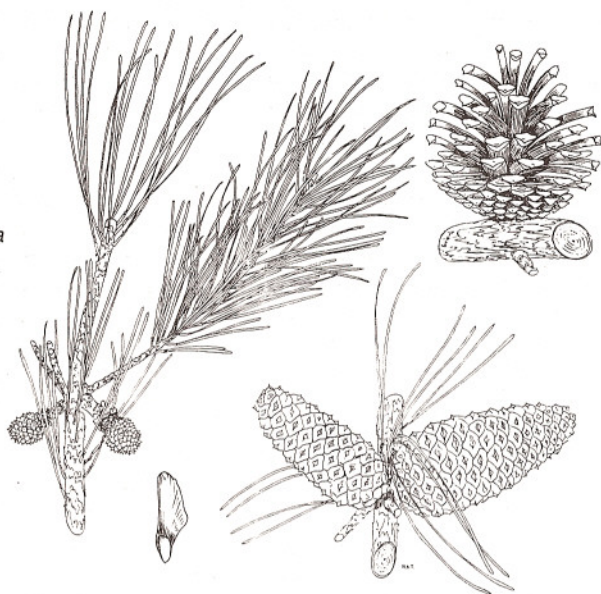
Sand Pine Pinus clausa

to the state, though often with scientific names that differ from current usage. The informative but little known, The Biology of Trees Native to Tropical Florida (Tomlinson, 1980), and the authoritative Trees, Shrubs, and Woody Vines of Northern Florida and Adjacent Georgia and Alabama (Godfrey, 1988)—though, as their titles indicate, restricted to only the trees of selected portions of the state—provide detailed descriptions, keys, and numerous illustrations.