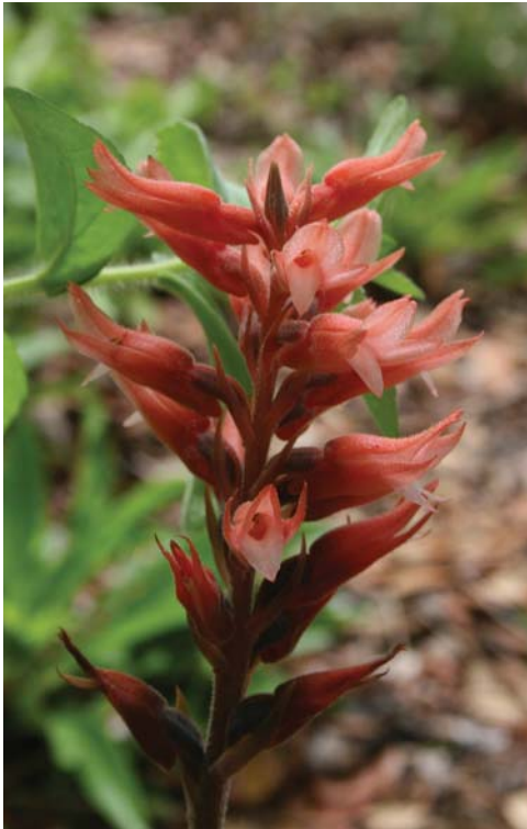
Typical flowers of Sacoila lanceolata var. lanceolata . Note the difference in color and flower structure from that of Sacoila paludicola .