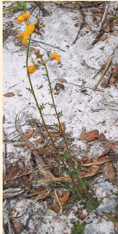
Chapmannia floridana flowers are perched along a long, erect stem almost waist high.

We know just snippets about Chapmannia floridana and the bee that pollinates it. But we don't need to know anything at all about either of them to marvel at the sight of dancing flowers in the morning ether. And what is a dance, but the coming together of two separate lives for just a moment, together creating the wonder that is life on earth.