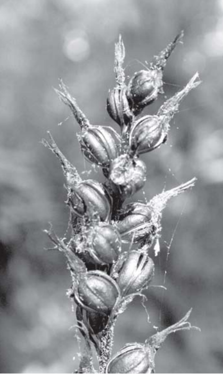
Dehiscing seed capsules. Because Sacoila paludicola is self-pollinating, nearly every flower develops into a seed capsule.

Hammer (2001) also cites anecdotal information questioning the natural occurrence of the colony recently found in Broward County. As such, the “leafy” variety of this orchid has one of the most-restricted natural ranges of any of Florida’s orchid species. Without more specimens for study, taxonomists largely accepted Luer’s original assessment that this orchid is a localized variety, shaped by its occurrence in the denser shade and wetter soils of the Fakahatchee Strand.