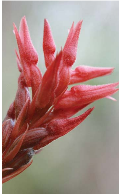
Late-season flower stalk of Sacoila paludicola . It is obvious that most flowers develop into seed capsules.