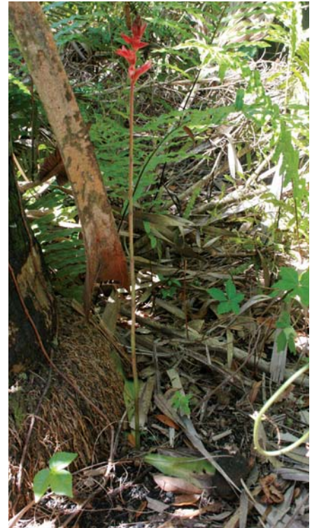
Typical Sacoila paludicola . Note yellowing basal leaves and the tall thin flower stalk typical for this species.