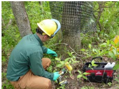
Insecticide is injected into the root flares of the pumpkin ash tree.

Because the insecticide is very expensive and the treatment process is labor intensive we were only able to treat a