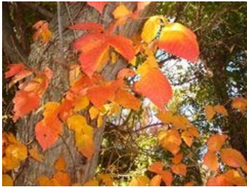
The three-leaved poison ivy fall foliage is orange to red.

Poison ivy is a deciduous perennial that is extremely variable in form; it can occur as a ground cover, an erect shrub, or a climbing vine. The vines can become quite