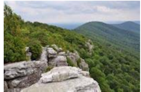
Scenic view of the George Washington National Forest.