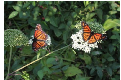
These viceroy butterflies nectar on the poison water hemlock's white floral clusters.