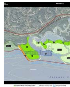
Breakwater (orange line) is a top priority.

permits before starting construction of the first phase, the breakwater on the southern end of the marsh to replicate the promontory removed by the dredgers. Once permits are obtained, construction will take around two years. The construction schedule will depend, in part, on the donation of appropriate fill material.