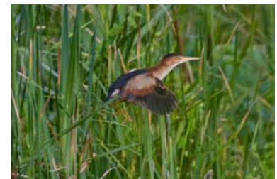
A juvenile Least Bittern emerges from cover.

weigh about 10 to 20 grams. By the 15th day they weigh 50 to 70 grams (almost as much as an adult.) Least Bittern young can leave the nest by the fifth day after hatching and can grasp vegetation with their long claws. Parents provide food for up to 30 days after hatching.