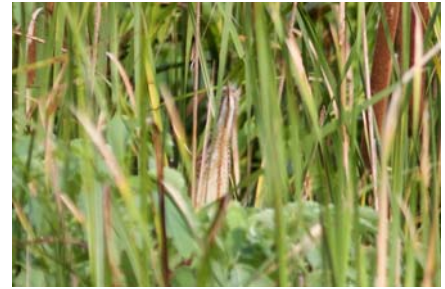
The Least Bittern freezes in place and extends its neck to camouflage with the marsh reeds.

Insects, fish, frogs, snakes, crayfish, slugs, snails and leeches make up most of its diet. Food items are secured while holding on to stems of emergent plants but may also be caught from hunting platforms where it stands and seizes