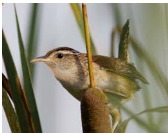
No evidence of nesting marsh wrens this spring for the first time ever.

Despite all the good news, we are deeply disappointed that we did not see evidence of any -- zero -- nesting marsh wrens this spring for the first time ever. Our preliminary research indicates that the upper Potomac-Maryland populations and Washington, D.C.-Anacostia River marsh wren populations appear to be