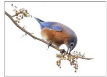
Many birds, including this bluebird, eat the berries of poison ivy.

Poison ivy provides food for a number of animals. White-tailed deer, muskrat, and eastern cottontail rabbits eat the leaves and stems and more than 60 species of birds (as well as some mammals) eat the fruits.