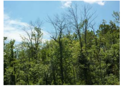
Significant leaf loss is observed among the pumpkin ash trees.