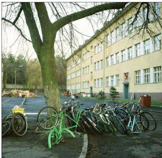
Figure 11. A glimpse of Wünsdorf after the withdrawal of Soviet forces in 1994.

was a response to the failed initiative of the Freunde der Bücherstadt Wünsdorf ('Friends of the Wünsdorf Book Town') to rename another street after the controversial commander Burlakov (Degener 2014a). As a common initiative of the Bücherstadt Wünsdorf and the Russian embassy, on the 20th anniversary of the withdrawal, in 2014, Anton Terentjew, who was a colonel general in Wünsdorf in 1993 and 1994 and thus played a significant role in the process of the withdrawal, returned and thanked the locals for their "maintenance of tradition" (Die Rückkehr 2014; Degener 2014b). On that day, gratitude for Europe's liberation from fascism was expressed in Wünsdorf, including greetings from local and national politicians, although at that time the conflict between Russia and the Ukraine was underway.