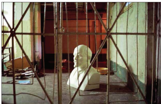
After the withdrawal, date