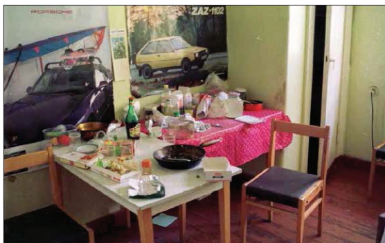
After the withdrawal, date

a success (e.g. Arlt 2010: 672), it is in a constant struggle for its existence: of the twenty original antiquarian booksellers, only three have survived, and there are 400,000 books waiting to be sold (Mallwitz 2015). There is also a garrison museum, Roter Stern ('Red Star'), which is supported by a local booster club and gives an interesting but quite uncritical overview of the Soviet/Russian stay in Germany, with both permanent and changing exhibitions showing the didactic and educational efforts to preserve the memory of Wünsdorf's military past (Fischer 2000; 2010).