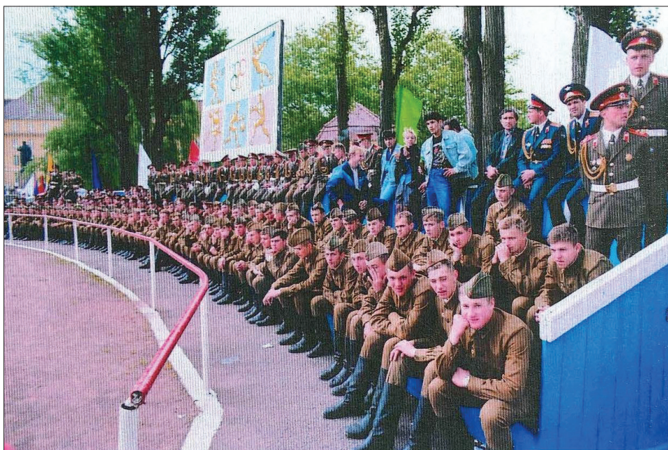
Figure 6. Spectators at martial arts performances in Wünsdorf. June 11, 1994 (Gehrke 2008: 61).

While these festivities were remembered positively by some, they also evoked serious political inconsistencies, and this still plays a key role in many memories: on that day, politicians from the Brandenburg state government came, but no representatives from the federal government or the federal armed forces were present (Kampe 2009: 49). In most of the interviews, people mentioned their disappointment, describing how they interpreted this as a sign of arrogance, and thus a downgrading of the Russian troops by the Bonn government, which seemed to reflect an ongoing lack of respect for the Eastern Germans' lives, as well as for the Russian Army. Moreover, the Russian withdrawal was accompanied by different, either intended or unintended, forms of "tactlessness", misconceptions, and friction. One prominent example is the appointment of Hartmut Foertsch as the director of the liaison organization between the German and Russian Armies. Foertsch's father Friedrich had served as a general during the 900-day siege of Leningrad in 1941.