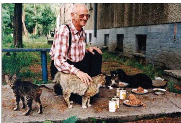
Figure 7–8. Glimpses of Wünsdorf after the withdrawal of Soviet forces in 1994.

ranging from a zero solution (i.e. renaturation), and an eco-city (“Architecture, Ecology, and Art”) to Germany’s largest city for refugees (which, according to a documentary, led to many objections from the locals (see Richter 1993)), 34 a leisure, service, technology, and innovation center like Silicon Valley, and a bureaucratic and satellite town with up to 20,000 inhabitants (“Good Night in Fresh Air”) (Kaiser & Herrmann 2010 [1993]: 201–202; Brüske 1993; Hénard 1993). In April 1995, there was a cabinet decision to maintain the character of the area and, using the name Waldstadt (‘Woody City’), which today is a part of the community of Wünsdorf, create a place for living, trading, administration, education, and working within an attractive environment. Furthermore, eighty million marks in aid money was made immediately available (Wieschollek 2005: