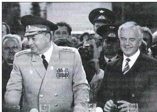
Figure 2. General Matvei P. Burlakov and Manfred Stolpe. Wünsdorf, June 11, 1994 (Gehrke 2008: 74).

By far, the largest number of troops were based in Wünsdorf. Since 1954 the headquarters of the high command of the Soviet Forces in Germany had been situated in this small town, less than fifty kilometers south of Berlin. Wünsdorf was a divided – military and civilian – location during the Cold War. The figures vary, but it can be assumed that between 40,000 and 70,000 soldiers and civilians were living and working there. Thus, the place was an immensely important strategic outpost and, because of its location close to the Cold War’s geographical border, the Western Group of Forces were regarded as the “chosen ones”, “the proud and favorite children” of the entire Soviet Army. 5