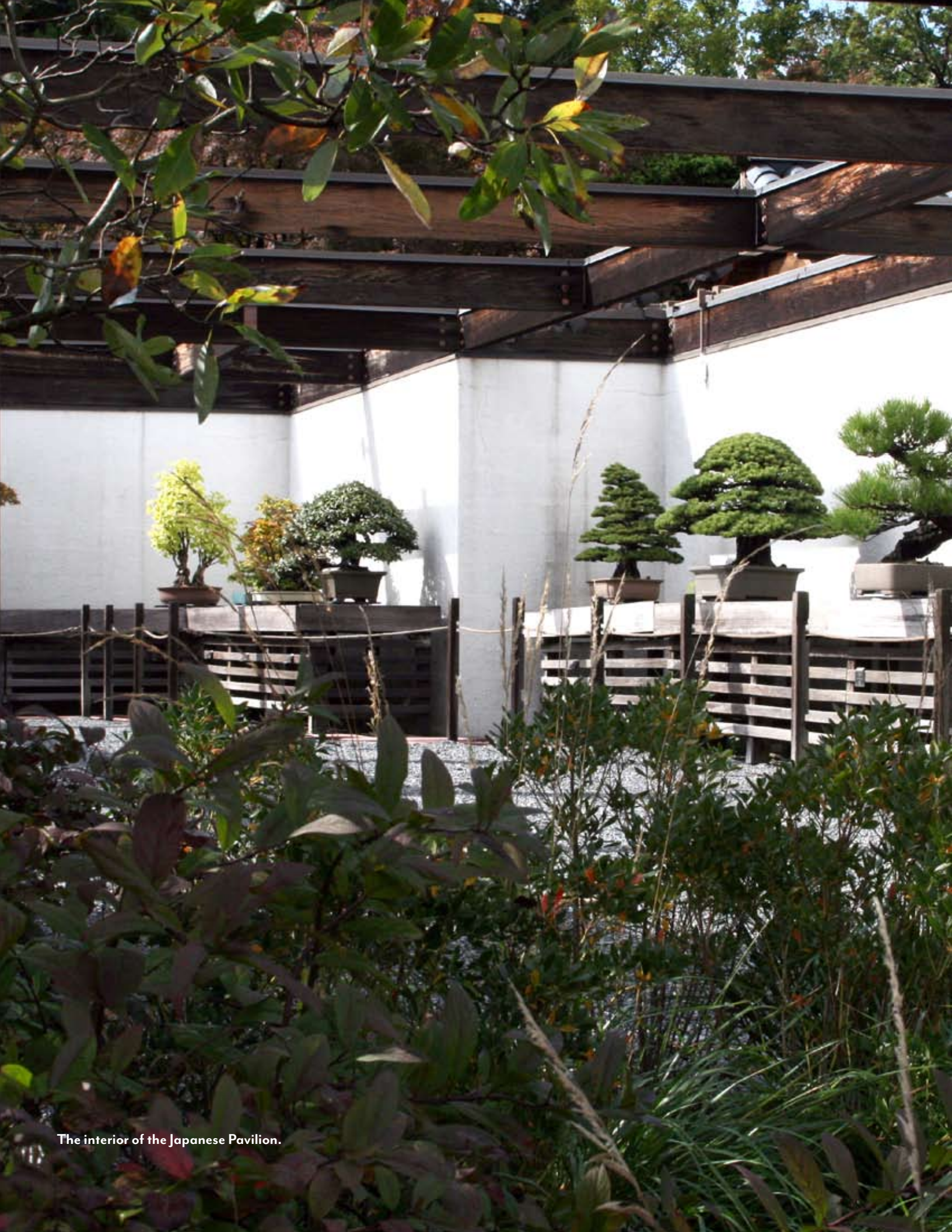
The interior of the Japanese Pavilion.